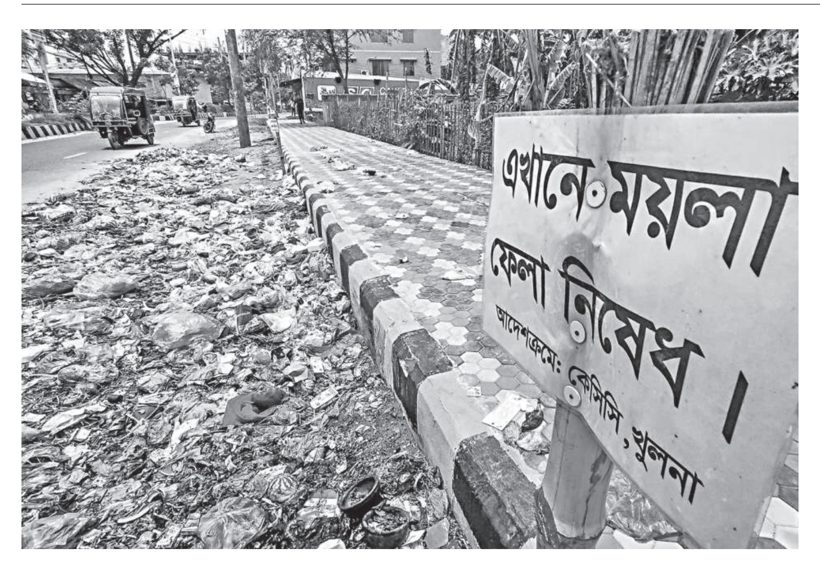
Despite a sign which reads, "Garbage dumping not allowed", waste accumulates unabated on the road just outside Khulna Medical College. This glaring disregard for cleanliness poses health hazards and underscores the urgent need for proper waste management solutions. This picture was taken from Sonadanga-Notun Rasta Road yesterday.