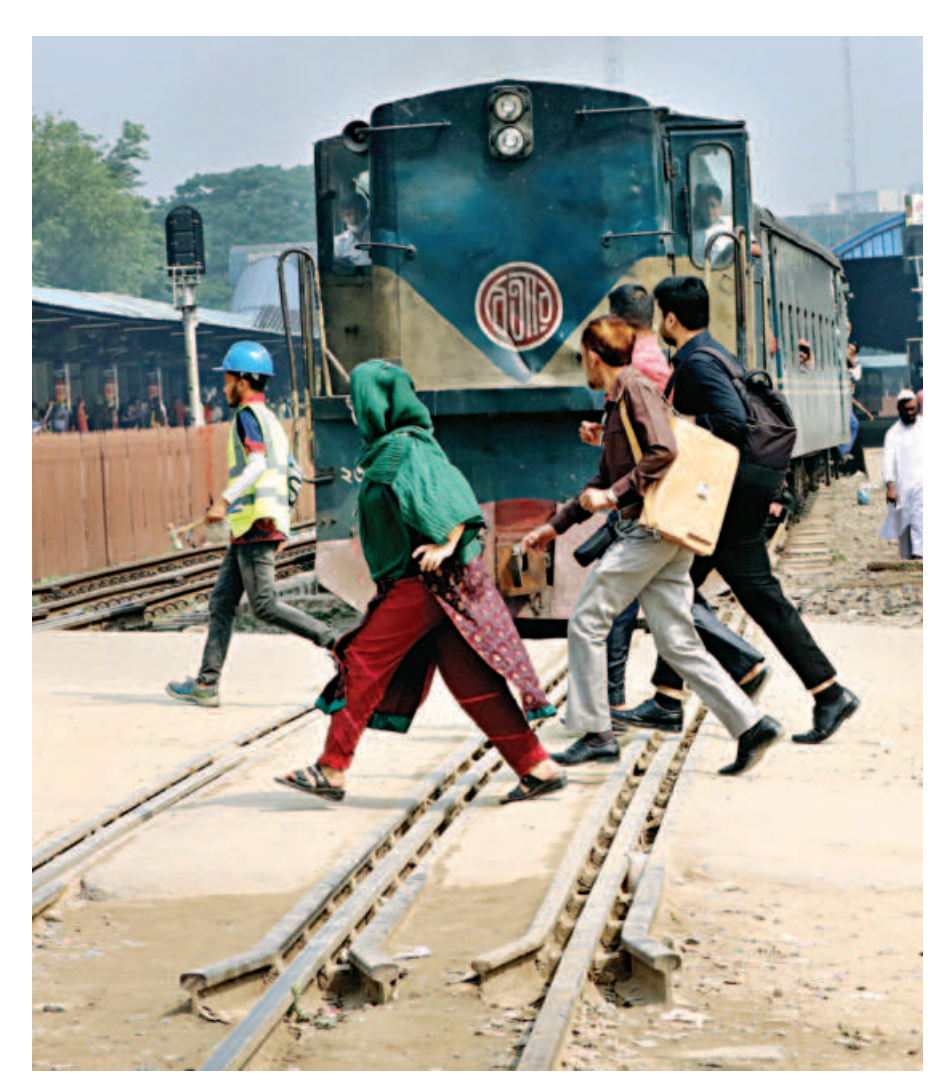
Pedestrians hurry across the rail lines as a train approaches near the Airport Railway Station in the capital yesterday. One tripping over could result in lifealtering injuries or even death.