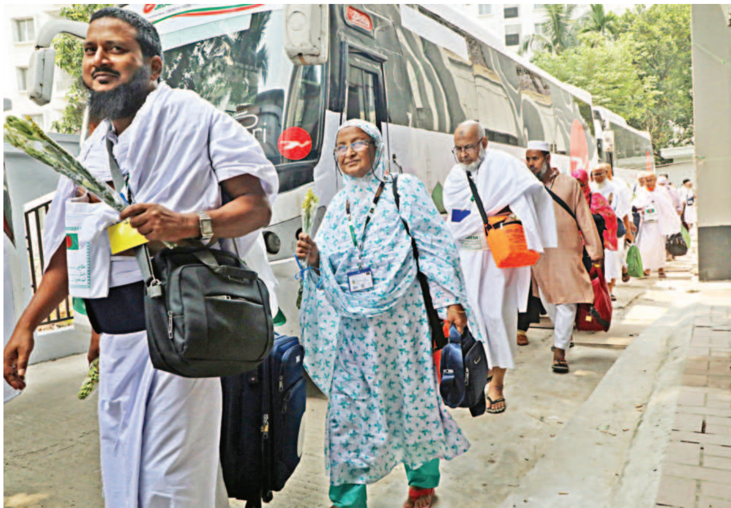
Pilgrims heading towards Dhaka airport from Ashkona hajj camp. This year's hajj flight started yesterday.