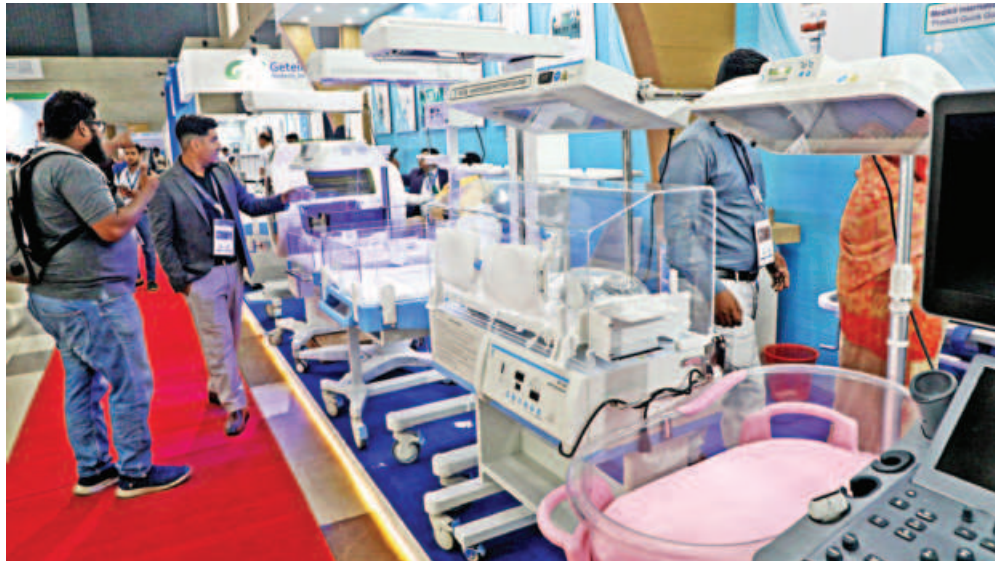
The representative of a pavilion showcasing medical equipment is seen speaking with a visitor about their products. The picture was taken yesterday, when a number of expos centring pharmaceutical products, services and equipment kicked off at the International Convention City Bashundhara in Dhaka.

Food Minister Sadhan Chandra Majumder inaugurated the exhibitions as chief guest,