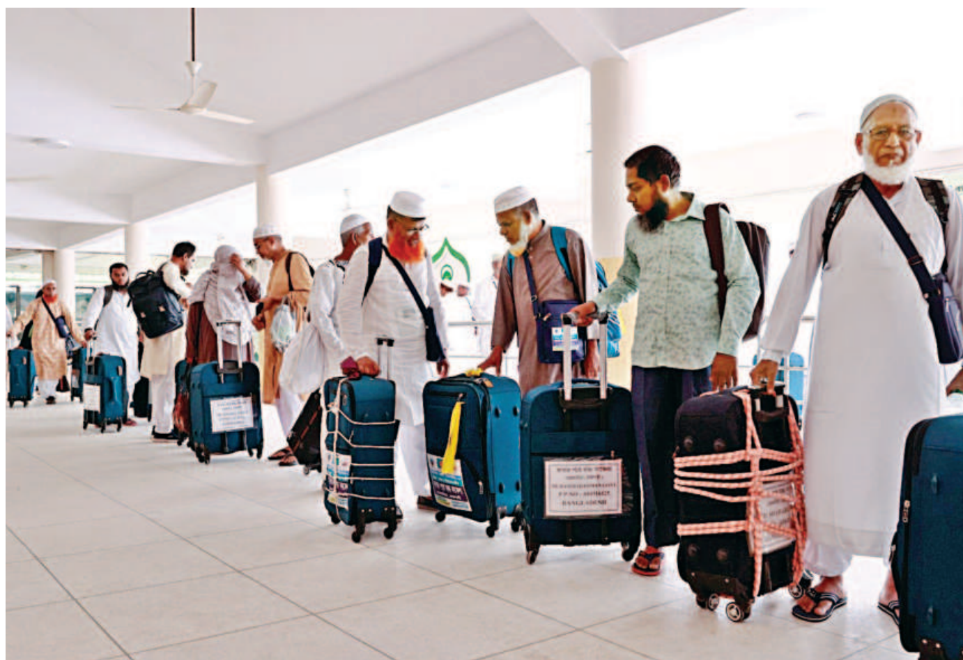
Pilgrims arrive at the Hajj Camp in the capital's Ashkona yesterday. This year's first hajj flight is scheduled to depart from Dhaka for Saudi Arabia at 7:20am today.