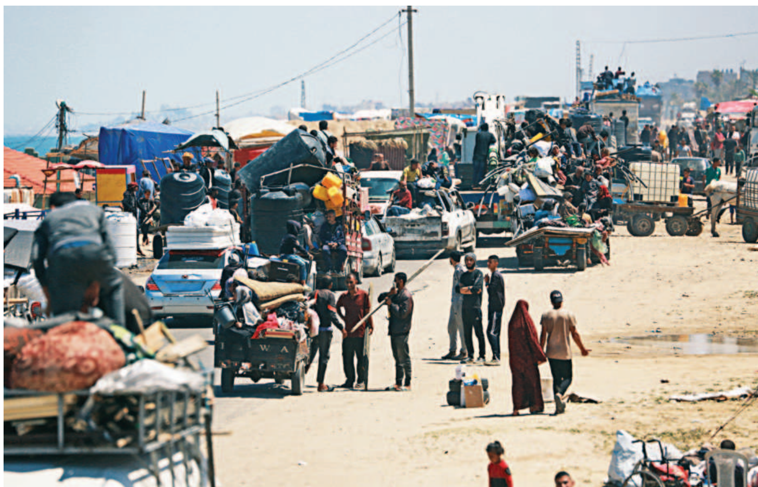
Displaced Palestinians arrive with their belongings to set up tents on a beach near Deir el-Balah in the central Gaza Strip yesterday as Israel bombarded southern Gaza city of Rafah.