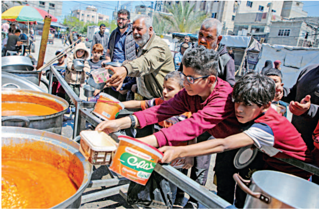
Palestinians gather to receive food cooked by a charity kitchen, amid shortages of aid supplies, after Israeli forces launched a ground and air operation in the eastern part of Rafah in the southern Gaza Strip yesterday.

The election commission wrote to the platform's Indian office on Tuesday saying the "objectionable" post violated Indian law. Yesterday, the original post had disappeared from the platform, with a notice saying it had been deleted.