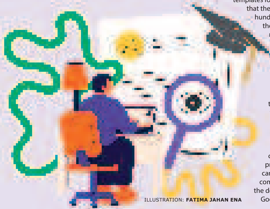
ILLUSTRATION: FATIMA JAHAN ENA

Every university and programme have resumé requirements with unique modifications. It's crucial that you cater your resumé to each program and present yourself as a potential and worthy candidate. It's not easy, and it might just come down to the finer details you put into the documents of your application. Good luck!