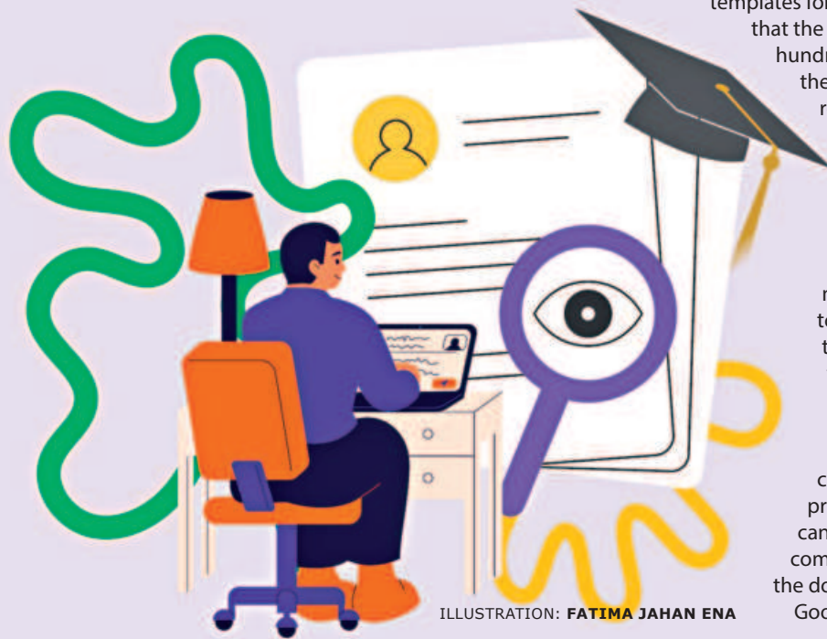
ILLUSTRATION: FATIMA JAHAN ENA

Every university and programme have resumé requirements with unique modifications. It's crucial that you cater your resumé to each program and present yourself as a potential and worthy candidate. It's not easy, and it might just come down to the finer details you put into the documents of your application. Good luck!