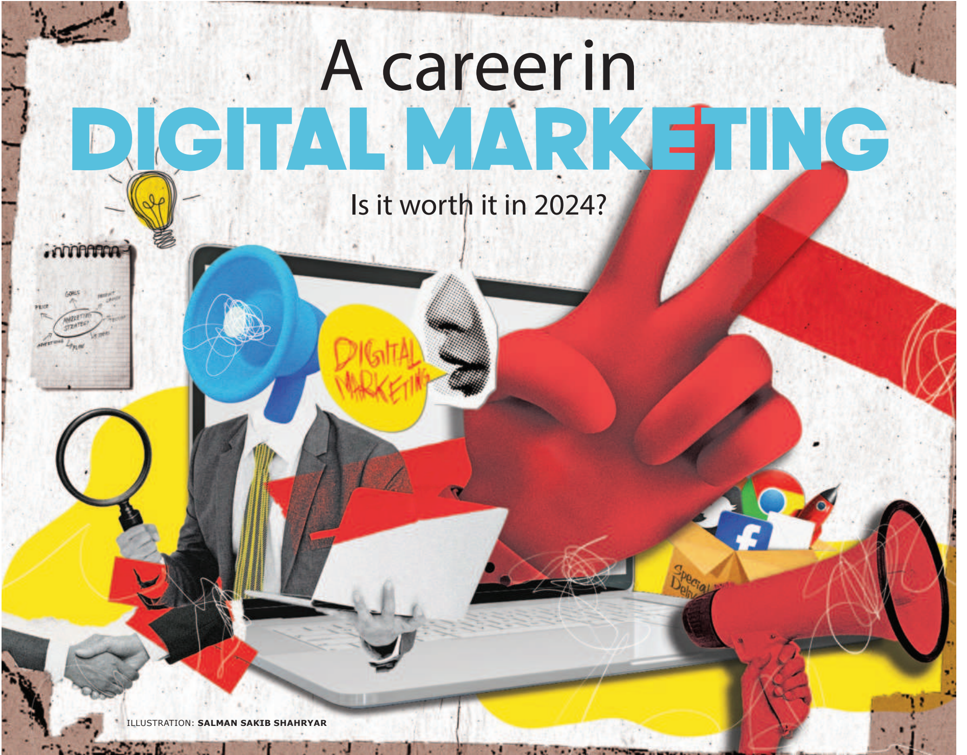
ILLUSTRATION: SALMAN SAKIB SHAHRYAR