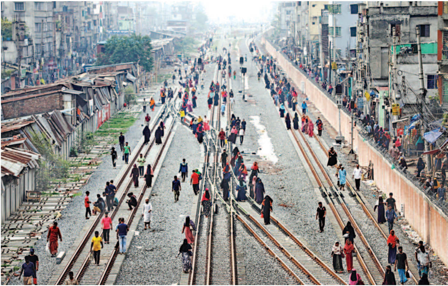
Garment workers walking on the rail lines on their way to work near the capital's Jurain rail gate around 7:30am yesterday. The workers and many others put themselves in harm's way just to take a shortcut.