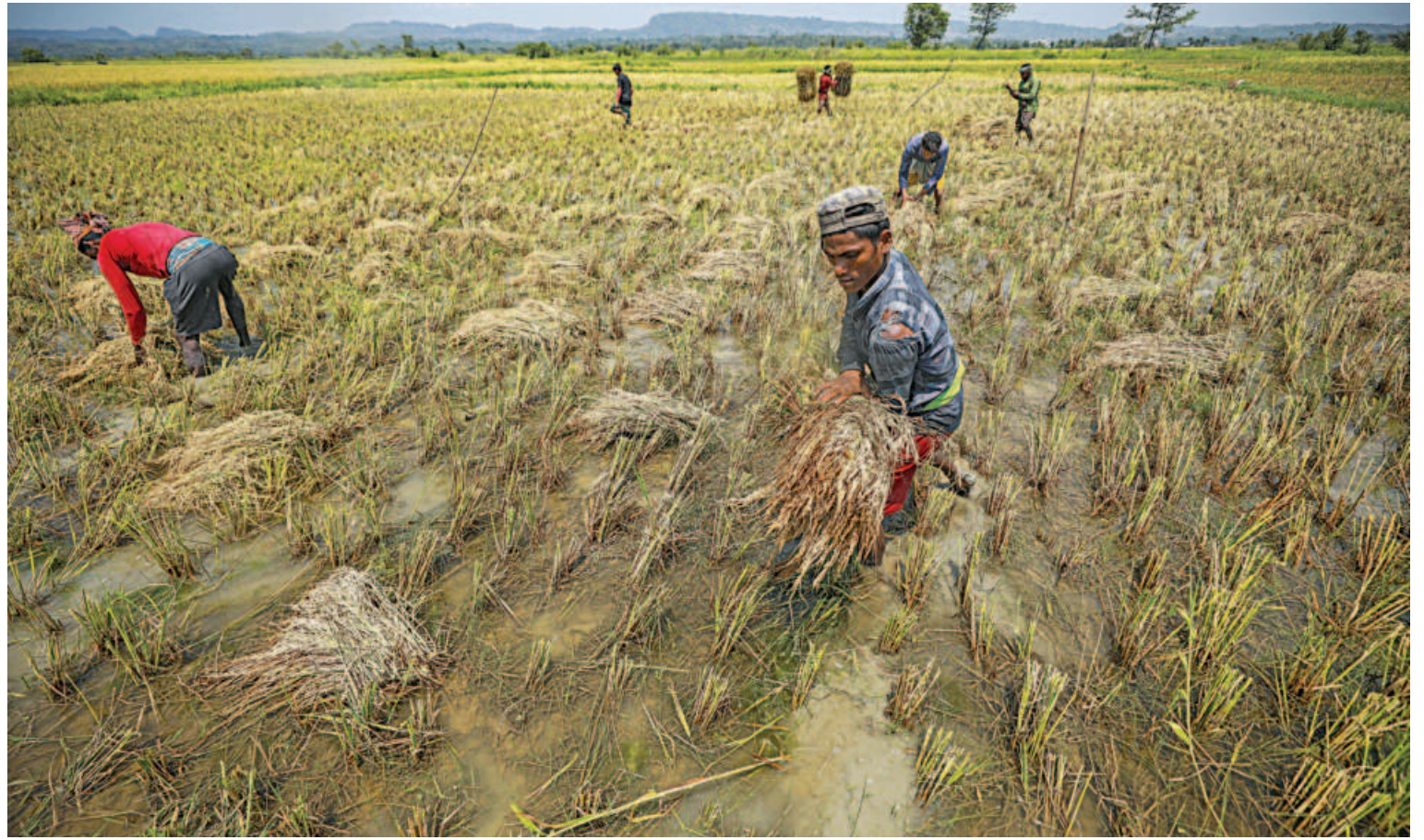
Farmers harvesting Boro paddy from a waterlogged field at Gumai Beel in Chattogram's Rangunia upazila yesterday. A nor'wester and a hailstorm hit the area on Sunday and Monday and damaged crops. Some growers said up to 30 percent of their crops were damaged.

The main purpose of the loan is to reduce pressure on the depleting reserves, which stood at $19.95 billion as of April 30, say sources.