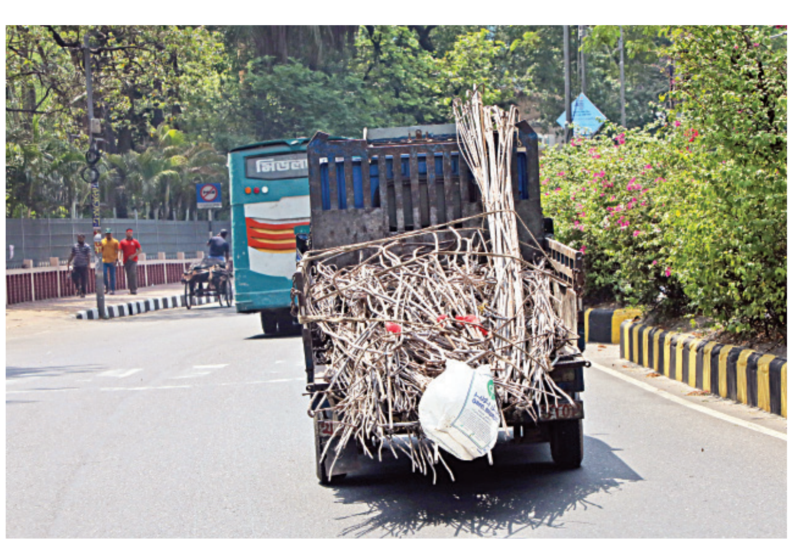
A van recklessly carries a cargo of rods near the Motsho Bhaban area. Seemingly secured by a couple of ropes, such careless actions can lead to a disaster. The photo was taken yesterday.

The following day, a truck ploughed through several vehicles in Jhalakathi, killing 14 and injuring 12 others. SEE PAGE 4 COL 3