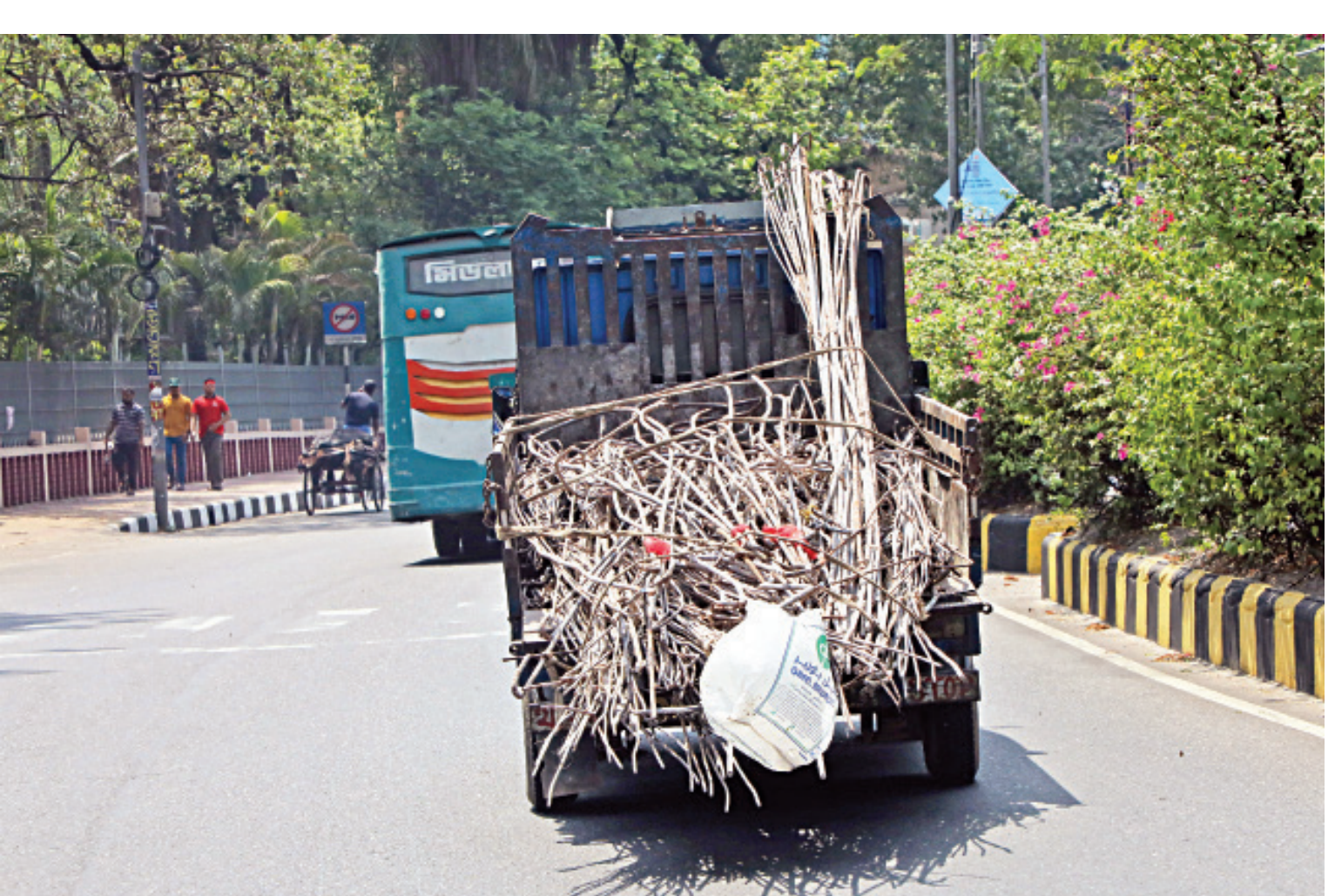
A van recklessly carries a cargo of rods near the Motsho Bhaban area. Seemingly secured by a couple of ropes, such careless actions can lead to a disaster. The photo was taken yesterday.