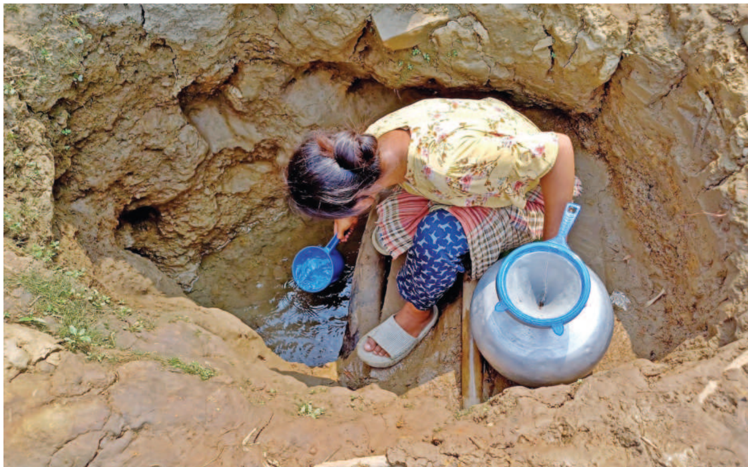
An indigenous woman collecting as much groundwater as she can from a 5-6ft deep hole dug up in soft soil on the Chimbuk hill in Getsimoni Para near Bandarban's Chimbuk-Nilgiri-Thanchi road. Amid the ongoing heatwave and an acute water crisis, the villagers living along the road have been facing unbound suffering. The photo was taken recently.