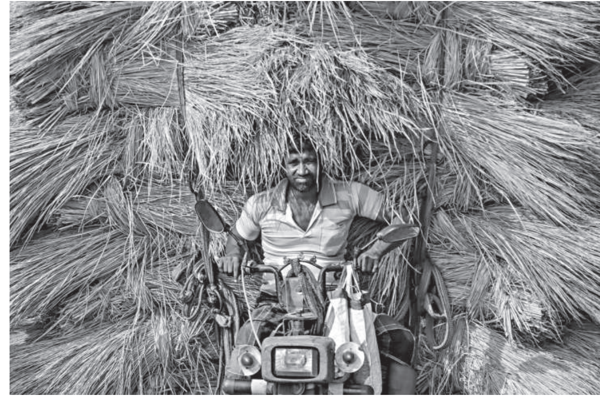
With loads of hay stacked on his makeshift vehicle, a trader hits the Chuknagar road in Khulna's Dumuria yesterday afternoon. Selling each bundle for Tk 3-4 as cattle feed, he roams around the upazila, making short