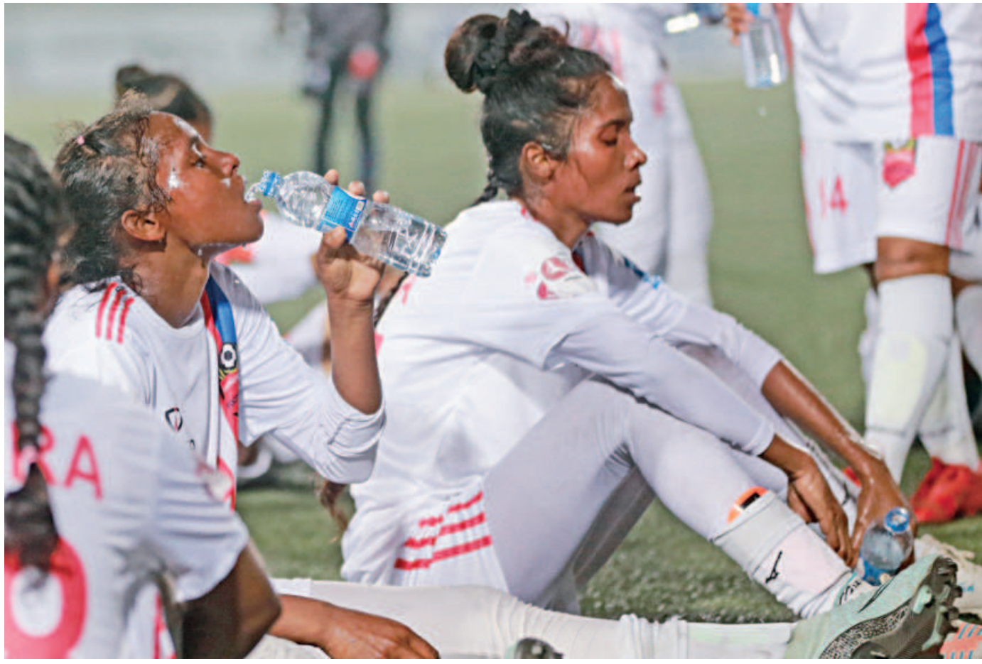
Exasperated Dhaka Rangers FC players sip on water in a cooling break during their UCB Women's Football League fixture against Siraj Sriti Sangsad under the floodlights at the Birshreshtha Shaheed Mostafa Kamal Stadium in Kamalapur yesterday. Despite the shift of matches to evenings, there was little respite for the players from the oppressive heat and humidity.