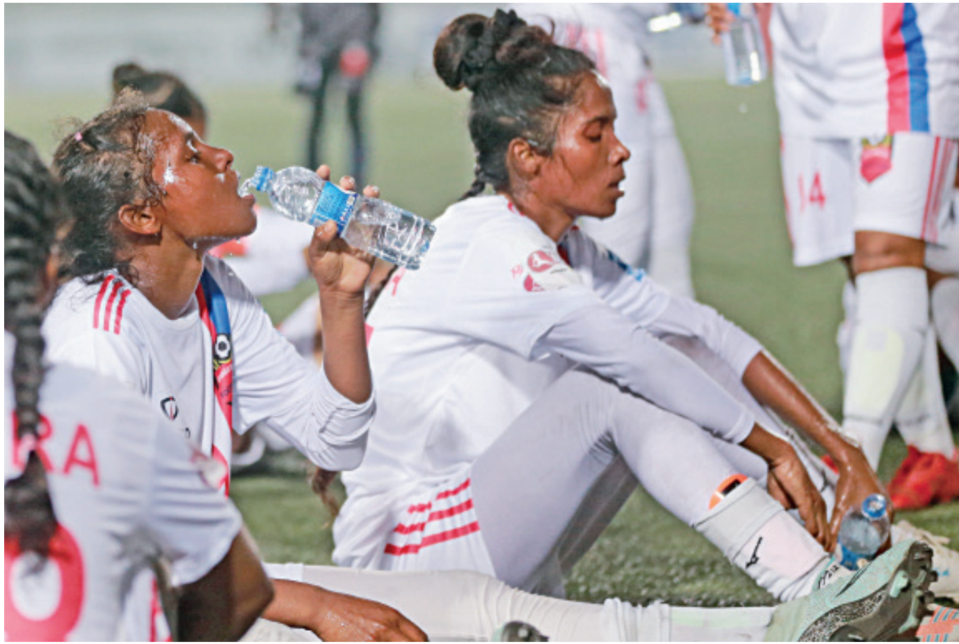
Exasperated Dhaka Rangers FC players sip on water in a cooling break during their UCB Women's Football League fixture against Siraj Sriti Sangsad under the floodlights at the Birshreshtha Shaheed Mostafa Kamal Stadium in Kamalapur yesterday. Despite the shift of matches to evenings, there was little respite for the players from the oppressive heat and humidity.

What to WATCH | TSPORTS Indian Premier League Kolkata vs Delhi Live from 8:00 pm