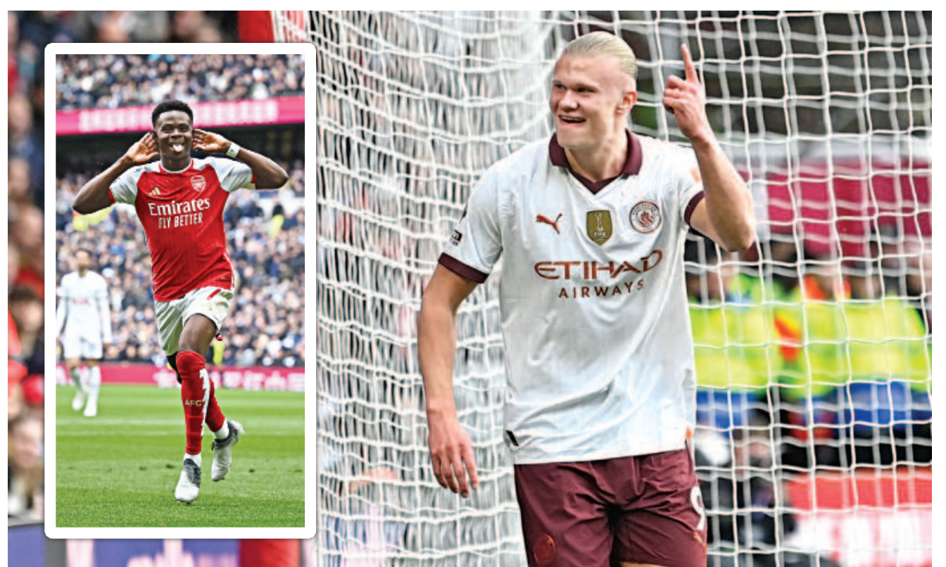
Manchester City striker Erling Haaland celebrates after netting his side's second goal in a 2-0 win over Nottingham Forest in the Premier League at the City Ground yesterday. With 79 points, second-placed City are now a point adrift from league-leaders Arsenal and have a game in hand. Haaland was on the bench on the evening and made an impact as a sub as he doubled City's advantage when he struck nine minutes after coming on in the second half. [Inset] Meanwhile, in the earlier fixture of the evening, Arsenal winger Bukayo Saka scored his side's second goal in a 3-2 victory in the north London derby over Tottenham Hotspur at the Tottenham Hotspur Stadium in the Premier League on Sunday.