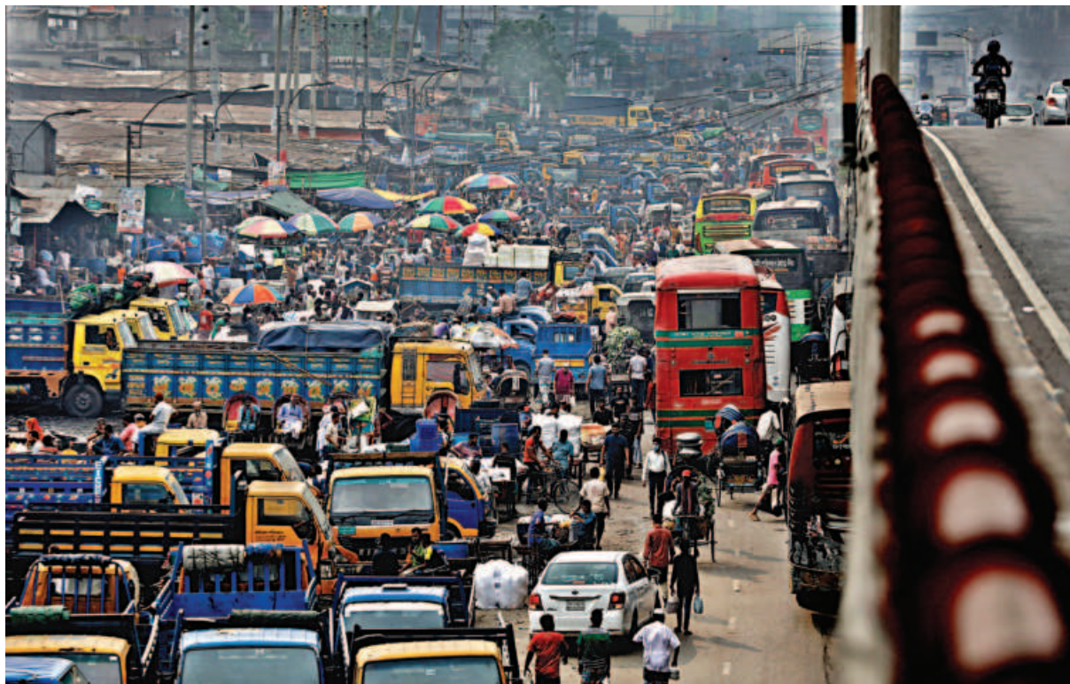
Rows of trucks parked on the road in front of Jatrabari kitchen market leave little room for traffic. Motorists say the inconsiderate behaviour and blatant violation of rules cause long tailbacks on the Dhaka-Chattogram highway.