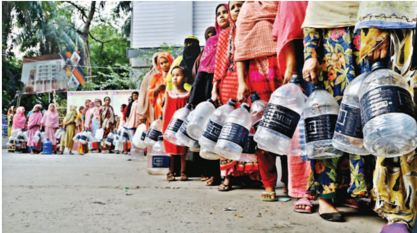
A winding queue of women and children waiting in the searing heat to fill their containers with water in the backyard of Dharmarajika Buddhist Temple in the capital's Basabo. Locals say the water pumped to the temple is cleaner than the water supplied by Dhaka Wasa. The monks provide free water to the locals three times a day.

The primary and mass education ministry yesterday said primary schools, which operate in one shift, will be open from 8:00am to 11:30am every day. For schools