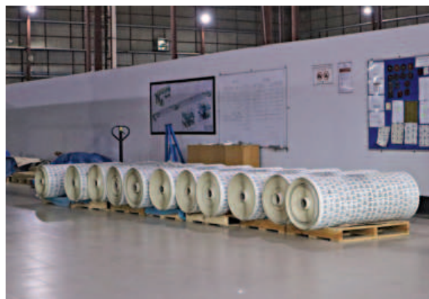
The market for sandpaper is growing because of higher economic growth of the country and infrastructure development.

"We see two different prices for sandpaper in case of import. Industrial importers are bringing it at $8-11 per kilogramme for their own use whereas the assessment value of sandpaper imported by commercial traders is far lower."