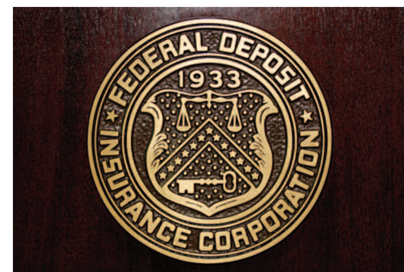
The logo of the Federal Deposit Insurance Corp (FDIC) is seen at its headquarters in Washington.

Fulton said the deal almost doubles its presence in the Philadelphia market with combined company deposits of