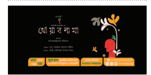
Prachyanat edition of 'Khowabnama'

April 30 | 7pm Bangladesh Shilpakala Academy