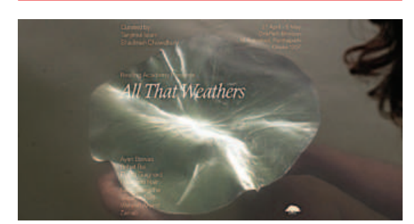
Pathshala presents 'All That Weathers'

April 27 | 5pm DrikPath Bhobon, Panthapath