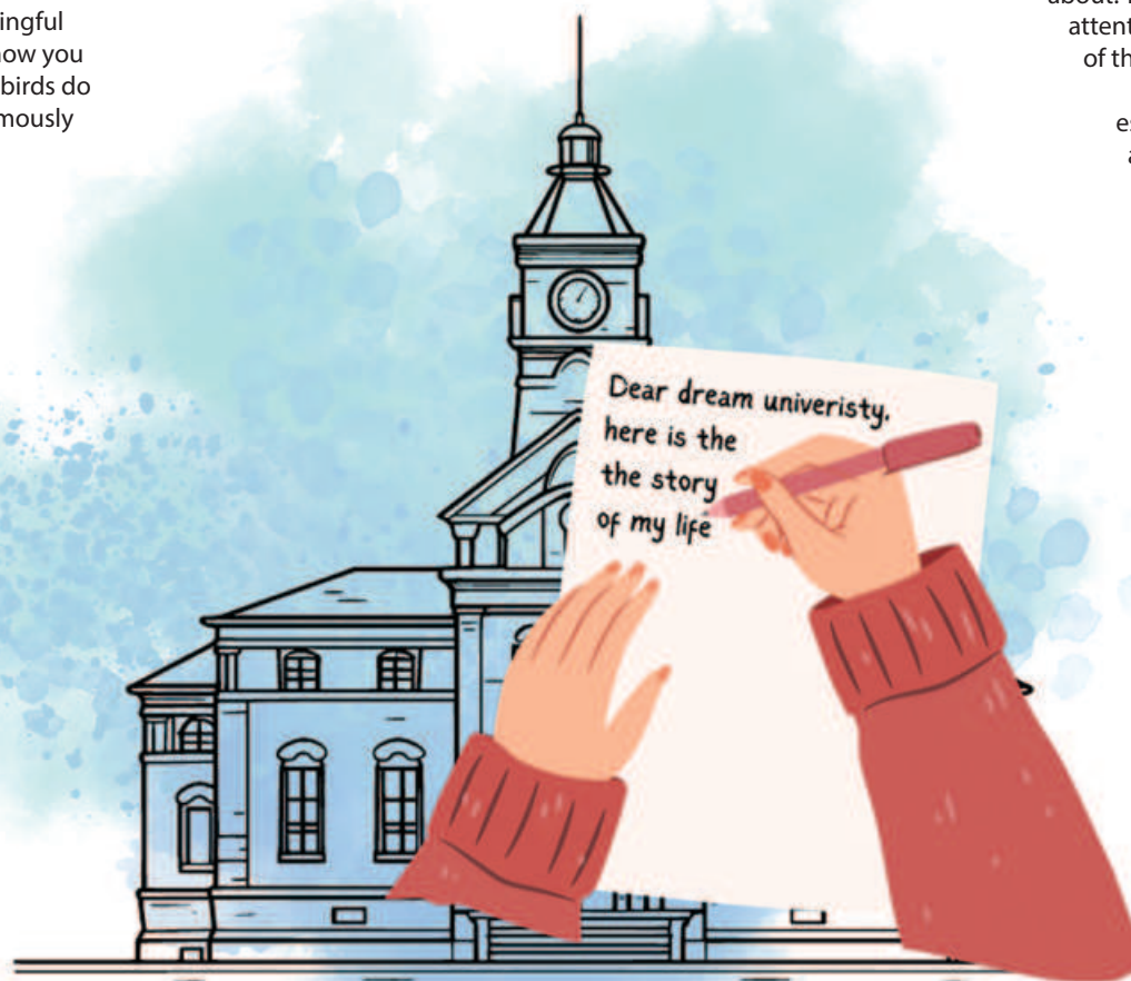
ILLUSTRATION: AMRIN TASNIM RAFA

Robiah is a former A level student at Mastermind English Medium School