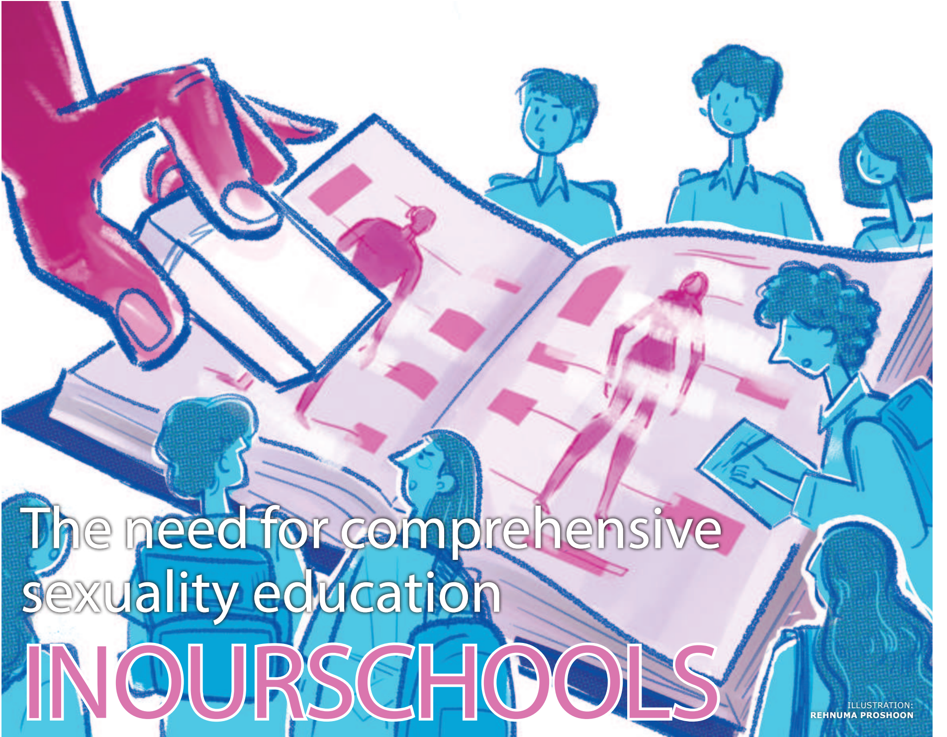
ILLUSTRATION: REHNUMA PROSHOON