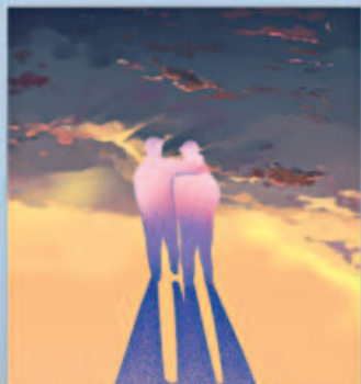
ILLUSTRATION: FATIMA JAHAN ENA