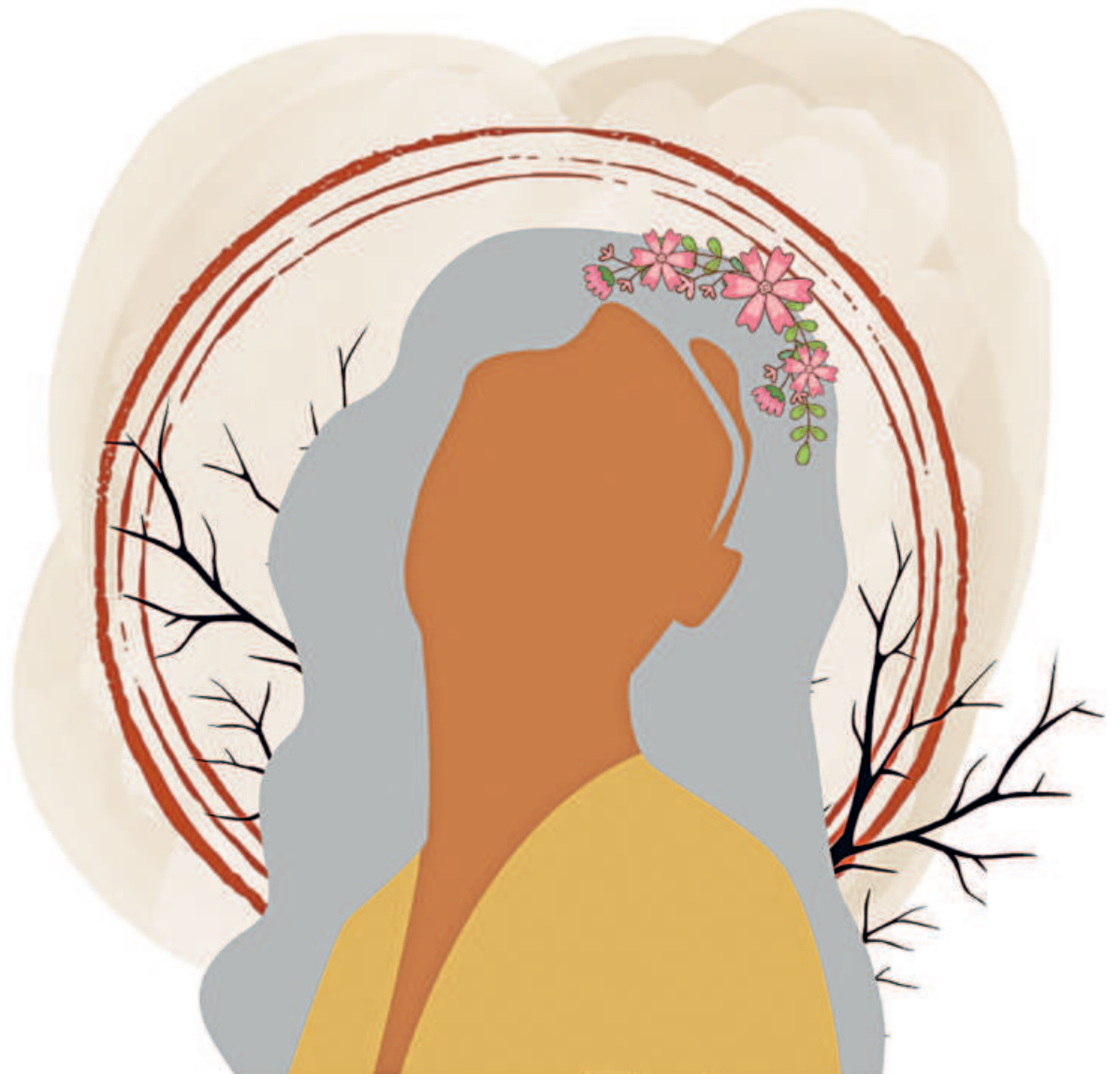
ILLUSTRATION: FAISAL BIN IQBAL