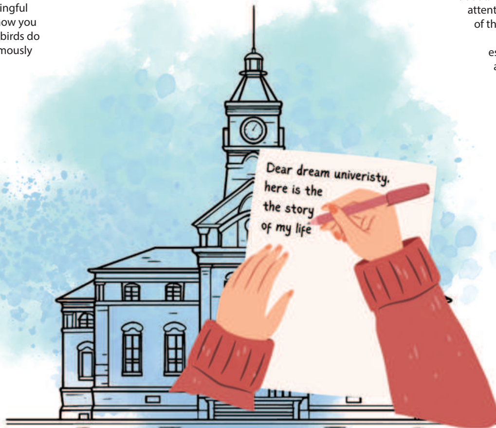
ILLUSTRATION: AMRIN TASNIM RAFA

Robiah is a former A level student at Mastermind English Medium School