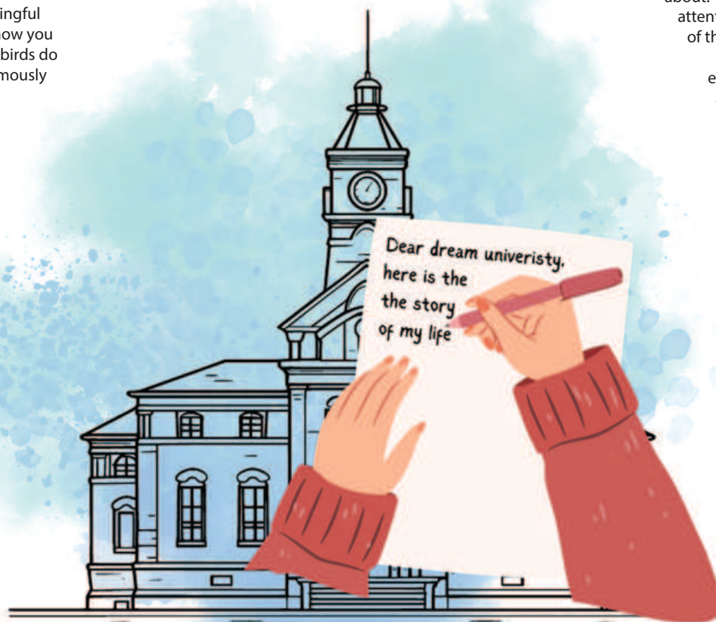
ILLUSTRATION: AMRIN TASNIM RAFA

Robiah is a former A level student at Mastermind English Medium School