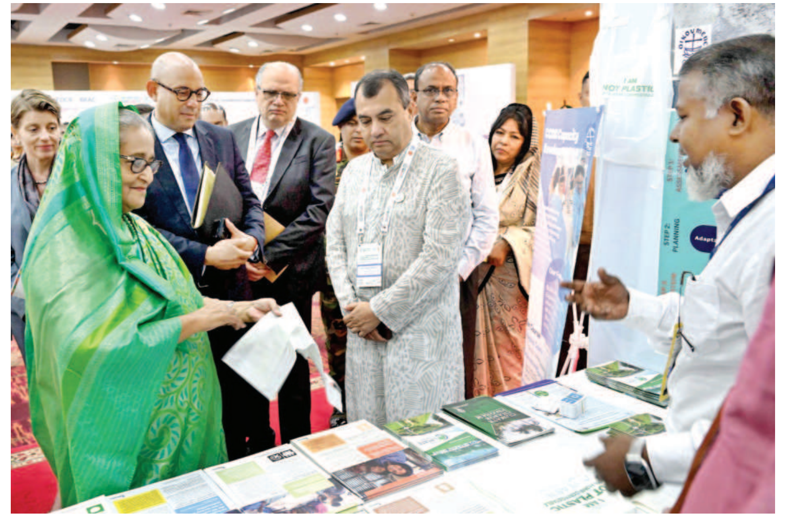
Prime Minister Sheikh Hasina visits a stall at the four-day UN Climate Adaptation Conference National Adaptation Plan (NAP) Expo 2024 at Bangabandhu International Conference Center yesterday.