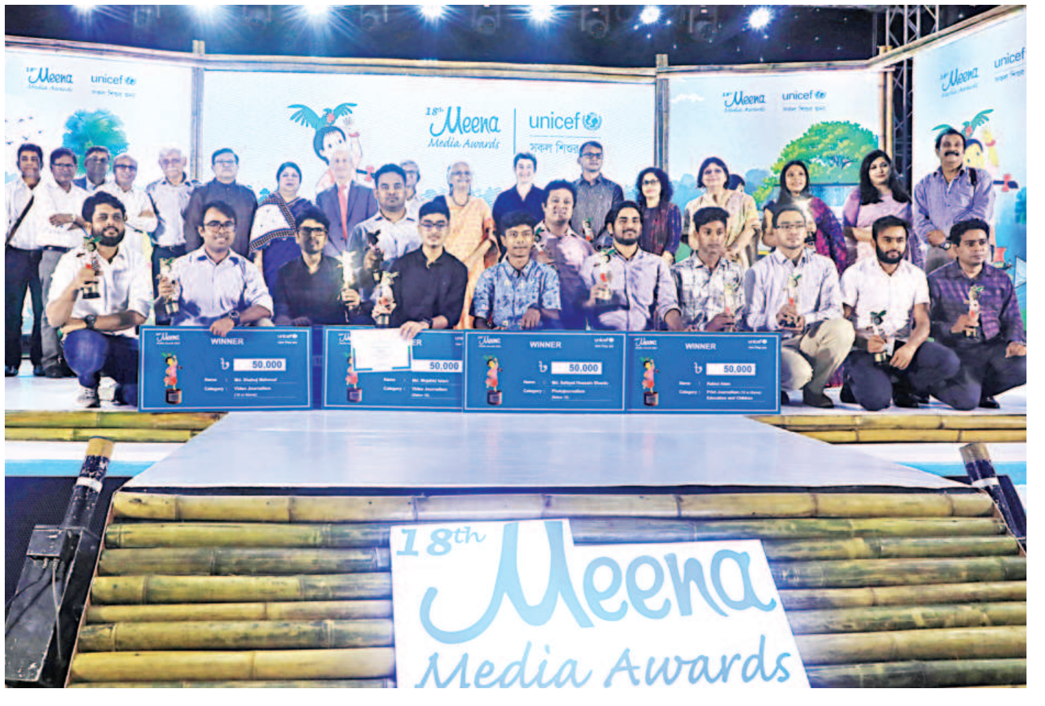
Fifteen journalists were honoured with Unicef Meena Media Awards yesterday for their reporting on children's issues. The event was held at a hotel in the capital.

Besides, the ACC has formed a three-member committee to investigate the reported involvement of two of its officials in the racket.