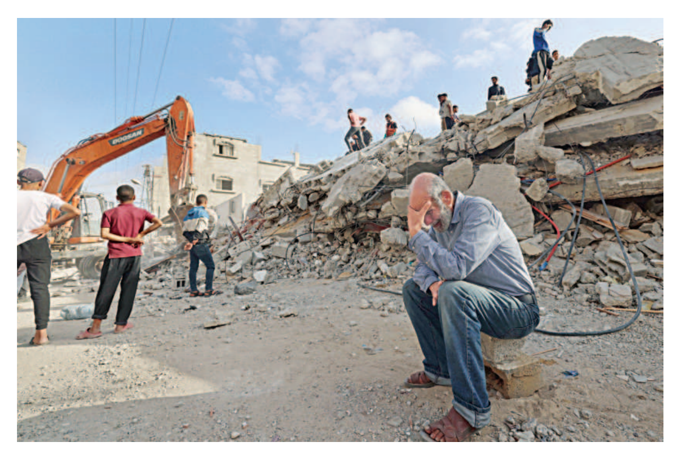
A Palestinian man waits for news of his daughter as rescue workers search for survivors under the rubble of a building hit in an overnight Israeli bombing in Rafah, in the southern Gaza Strip yesterday.

The main opposition Congress party had demanded a re-run at 47 Manipur polling stations, alleging that booths were captured and elections were rigged.