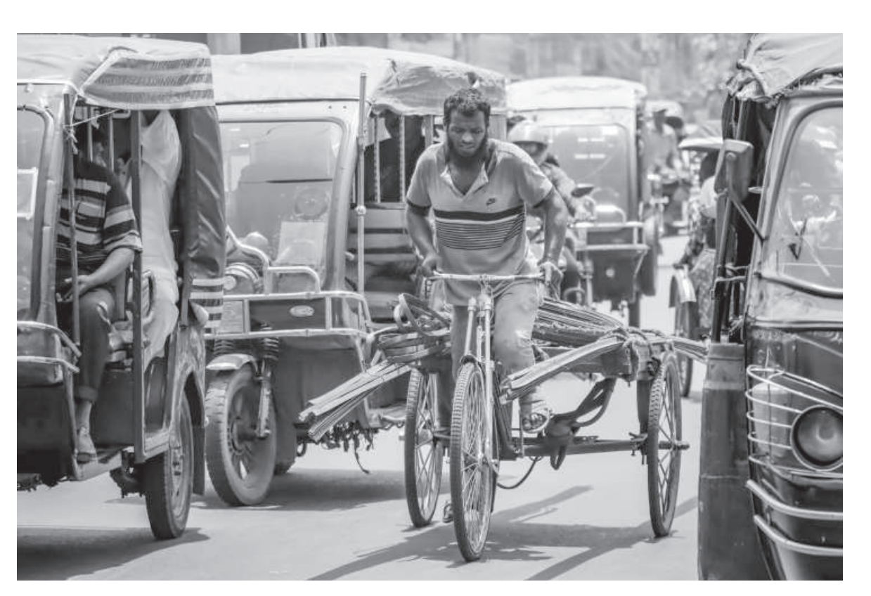
A rickshaw van transporting rods on Khulna-Jessore highway yesterday. Slow-moving vehicles like these pose significant risks on highways, exacerbating the possibility of accidents. Besides, lack of safety measures while transporting rods further heightens the danger.

Police said they are vorking to trace the