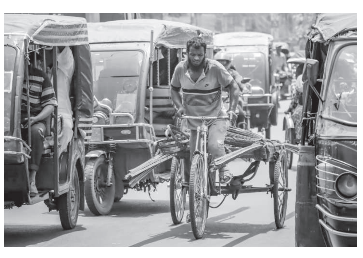
A rickshaw van transporting rods on Khulna-Jashore highway yesterday. Slow-moving vehicles like these pose significant risks on highways, exacerbating the possibility of accidents. Besides, lack of safety measures while transporting rods further heightens the danger.

Police said they are vorking to trace the