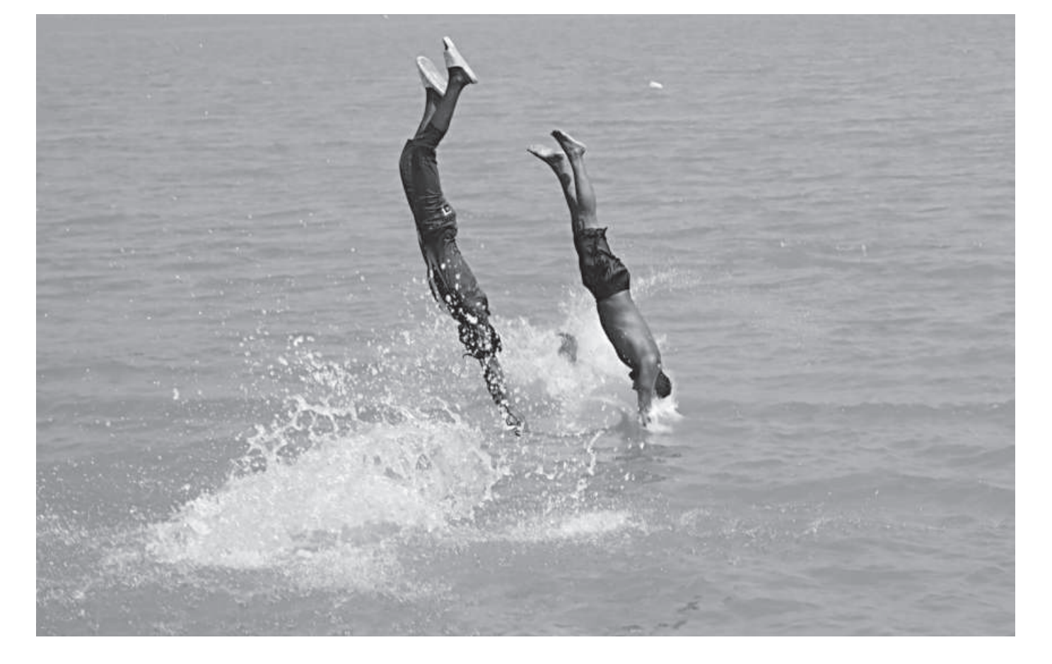
Teens take a dip in the Kirtankhola river to get some respite from the sweltering heat. A severe heatwave is disrupting the lives of people in different parts of the country. The photo was taken in Chadmari area of Barishal city yesterday.

When asked why many of them are still in the election process, Quader said, "Let the date of withdrawal [of nomination papers] be over; then we