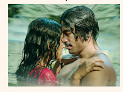
Binge Tiger Three