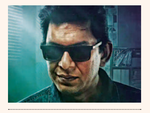
Chorki Last Defenders of Monogamy