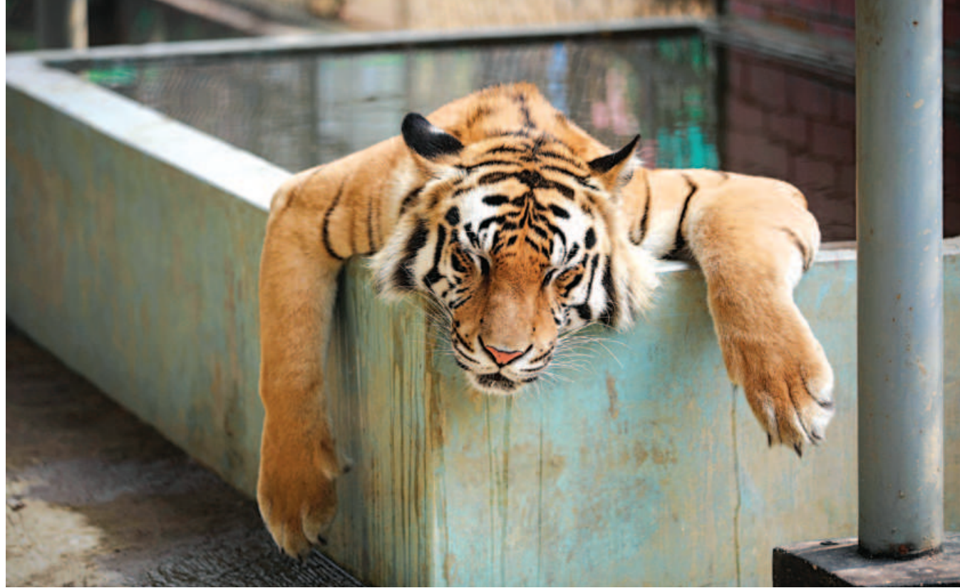
OH, RELIEF! ... A tiger finds some respite from the searing heat as it takes a dip in the water reservoir in its cage at the Chattogram zoo. Humans and animals have been suffering immensely due to a severe heatwave sweeping across the country. The photo was taken yesterday afternoon.