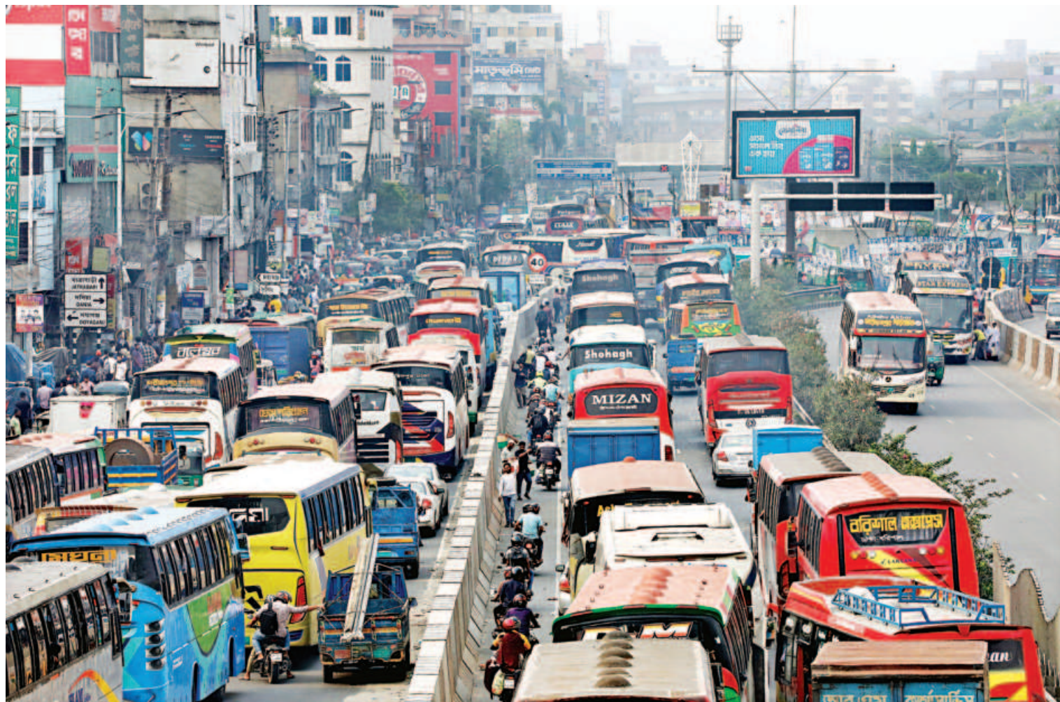
Vehicles, mostly buses bound for Dhaka from southern districts, are caught in a tailback in the capital's Shyampur around 3:30pm yesterday. The entry to the city saw snarl-ups due the rush of Eid holidaymakers returning to Dhaka.