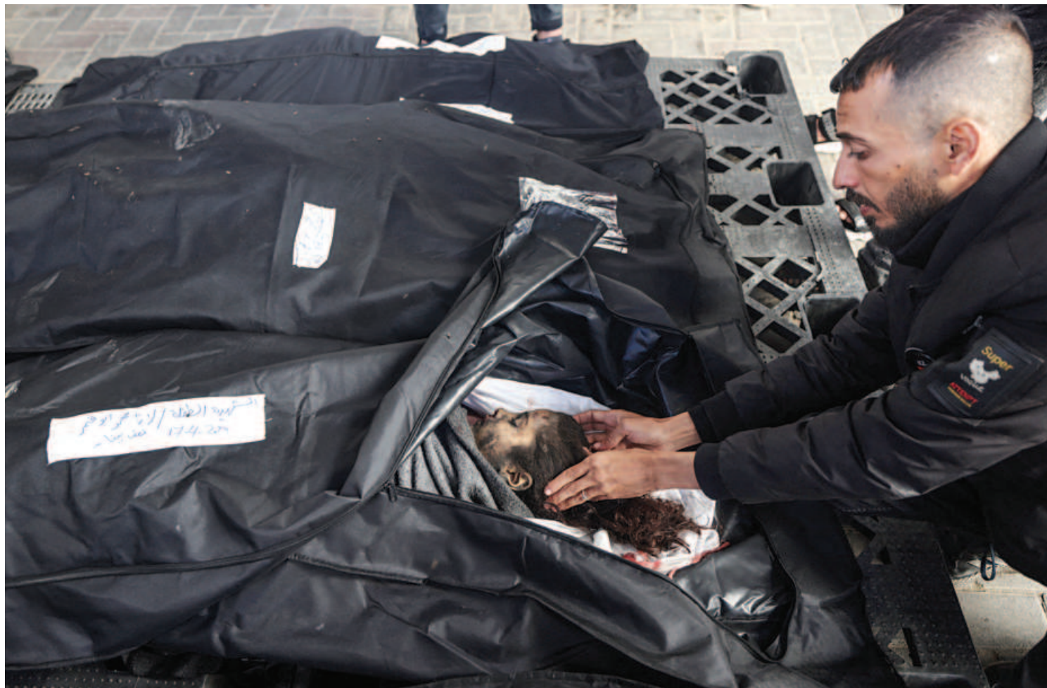
A man touches the head of a child killed following Israeli bombardment in Rafah in the southern Gaza Strip yesterday.