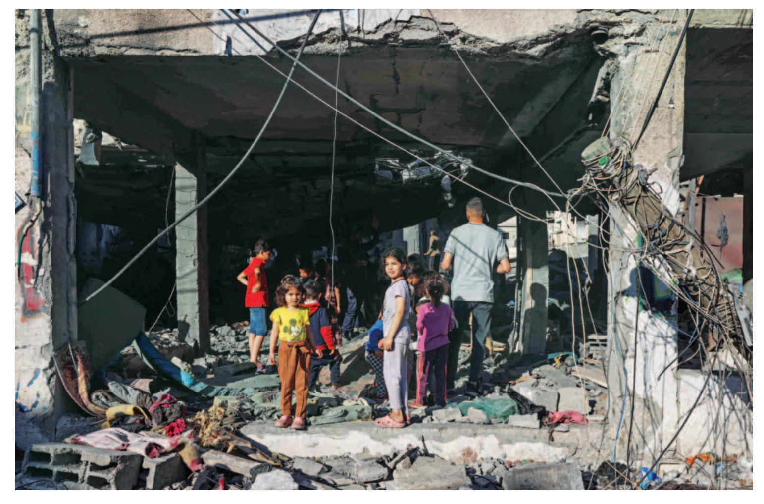
Palestinian children check a building destroyed by Israeli bombardment in Rafah in the southern Gaza Strip yesterday. Israeli media have quoted security sources as saying the long-feared Rafah offensive was due to start this week but the plans have been upended by the Iranian attack.

It said Islamabad took up the issues with X, which demonstrated a reluctance to resolve them. "The decision to impose a ban on Twitter/X in Pakistan was made in the interest of upholding national security, maintaining order, public and preserving the integrity of our nation", the report said.