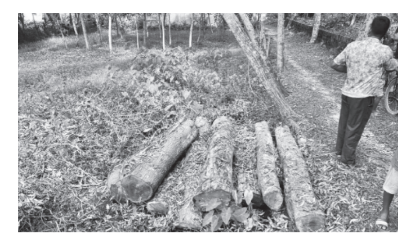
OUR CORRESPONDENT, Moulvibazar

Around 450 trees, including at least 52 Akashmani trees, have been illegally felled and sold off on a government land within Luayuni-Holicherra Tea Garden area under Kulaura upazila of Moulvibazar.