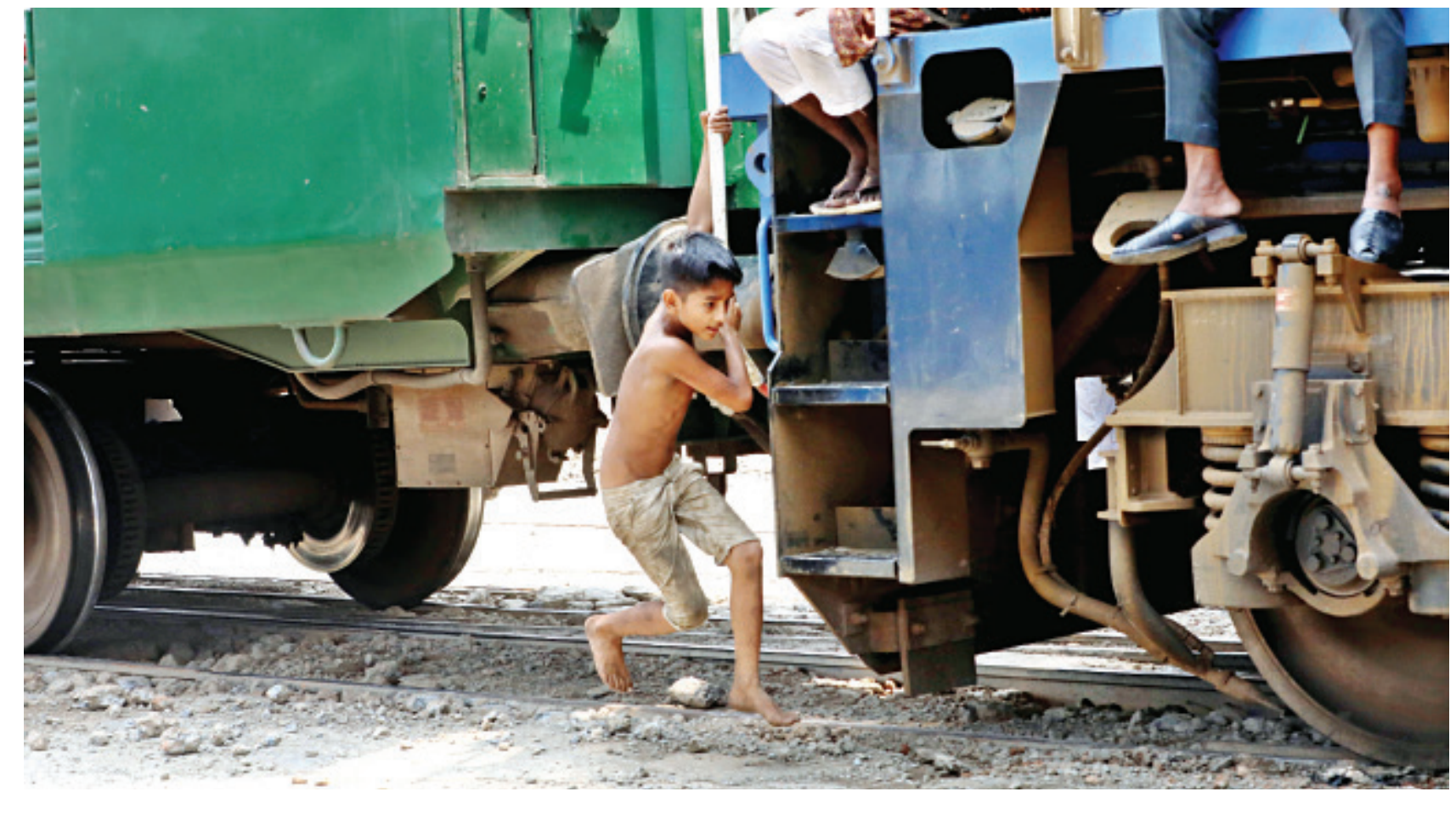
An adolescent boy risks life and limb while trying to board a moving train in the capital's Tejgaon yesterday. This is not an isolated incident as people have long been getting on and off moving trains on this particular stretch of the rail line.

One of their relatives said it was supposed to be a happy moment for all as they were to return home with the bride and groom. Instead, they SEE PAGE 2 COL 3