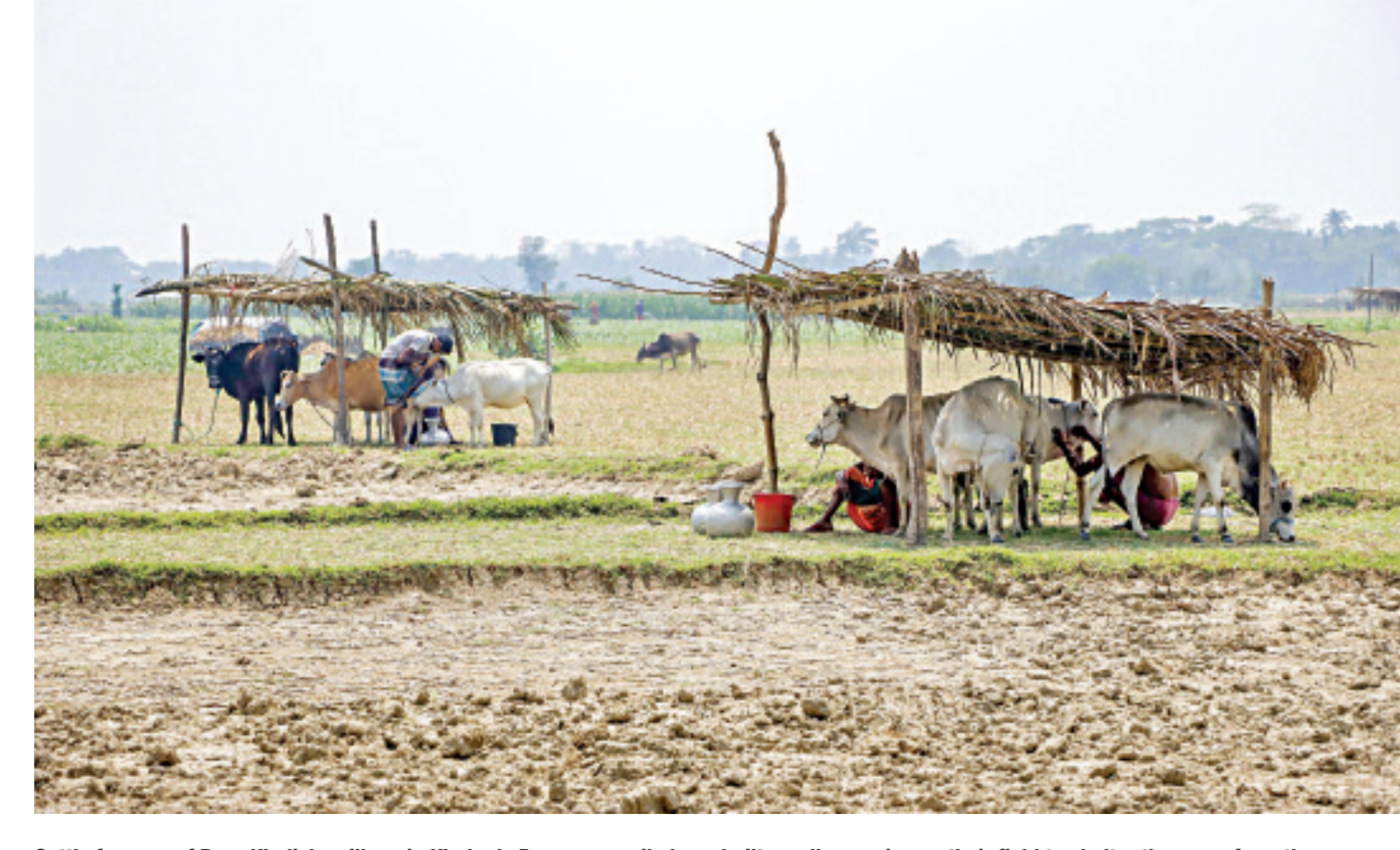
Cattle farmers of Bara Khalisha village in Khulna's Dacope upazila have built small canopies on their field to shelter the cows from the scorching sun. The intense heat has caused surrounding waterbodies to dry up, prompting the farmers to collect water from other places to keep the cows hydrated and healthy.