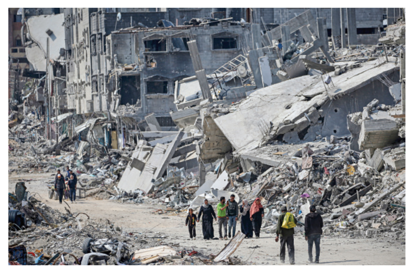
People walk amid the rubble of buildings destroyed during Israeli bombardment in Khan Yunis, on the southern Gaza Strip vesterday. The UN children's agency (Unicef) called for an increase in medical evacuations from Gaza, saying less than half of applications had been successful.

Hezbollah fighters launched an "air attack with suicide drones in two phases... striking the Iron Dome platforms and their crew", the group said in a statement. The Israeli local regional council said that three people were hurt in the explosion.