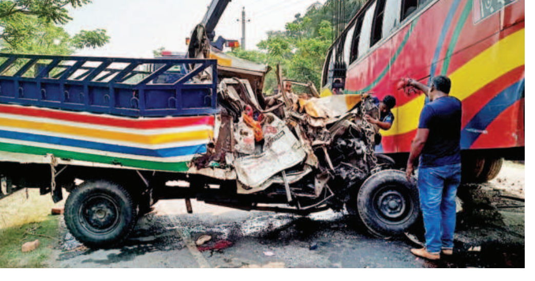
The mangled remains of a pickup being removed from Faridpur-Magura highway after it collided head-on with a bus in Faridpur's Kanaipur area yesterday.

"Where are my parents? Why haven't they come to see me? Take me to them." He was given the same response every