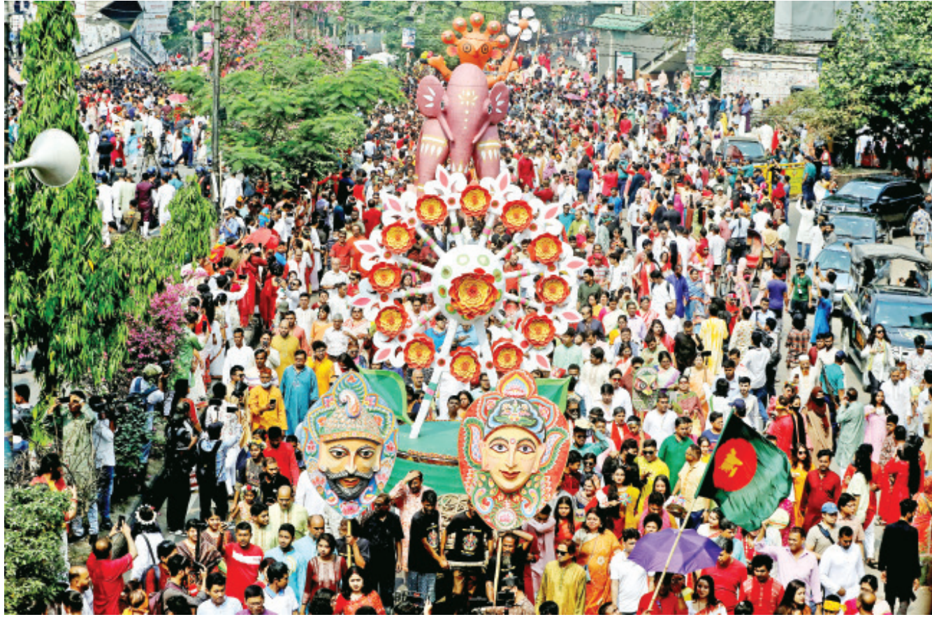
The Mangal Shobhajatra in front of Dhaka University's Institution of Fine Arts on Pehela Baishakh, the first day of the Bangla New Year 1431. People of all ages adorned in Baishakhi clothes joined the procession calling for a safe and peaceful world.