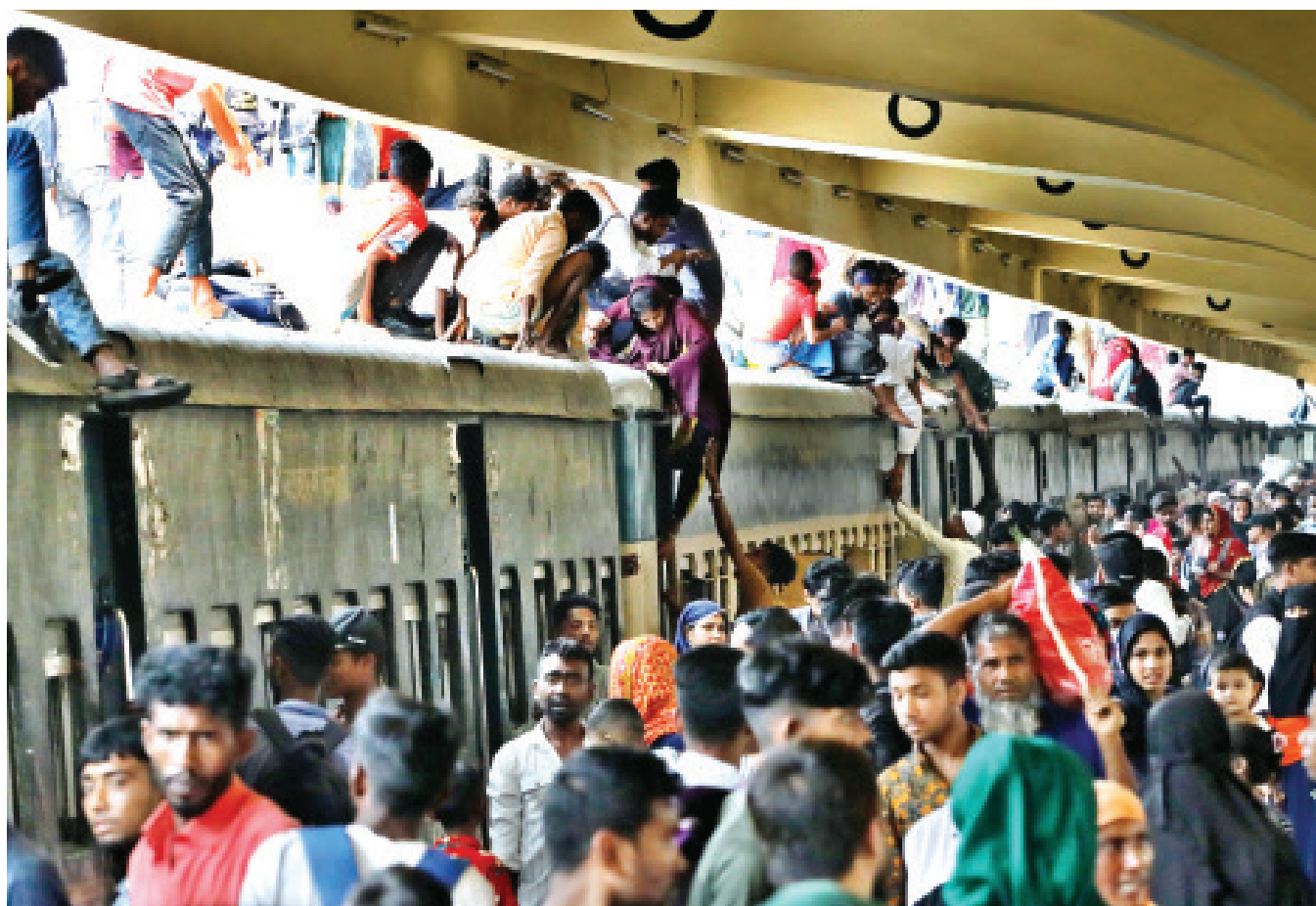
People started returning to Dhaka in droves after celebrating Eid and Pehela Baishakh with their near and dear ones. The photo shows people getting off Jamalpur Commuter at the Kamalapur Railway Station around 12:40pm yesterday. Trains reaching Dhaka from across the country were packed with passengers. Some even travelled on the roofs of carriages risking their lives.