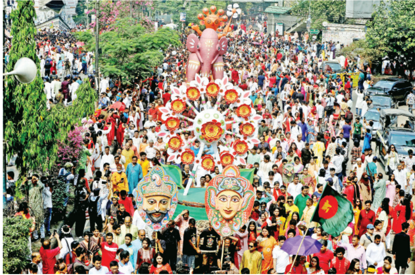
The Mangal Shobhajatra in front of Dhaka University's Institution of Fine Arts on Pahela Baishakh, the first day of the Bangla New Year 1431. People of all ages adorned in Baishakhi clothes joined the procession calling for a safe and peaceful world.