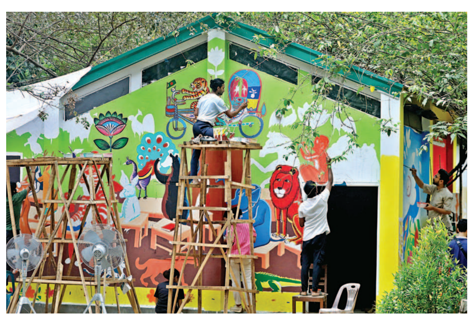
Students of Dhaka University's Fine Arts faculty painting the Joynul Shishu Niketon on the Charukola premises in bright colours and Baishakh motifs just ahead of the upcoming Bangla New Year. Every year, they decorate the premises and the adjacent streets for days, before bringing out the massive "Mongol Shobha Jatra" on the day of the occassion.

SEHRI, IFTAR TIMING RAMADAN | APRIL | SEHRI | IFTAR 6:21 4:21 6:21 10 4:20 6:22