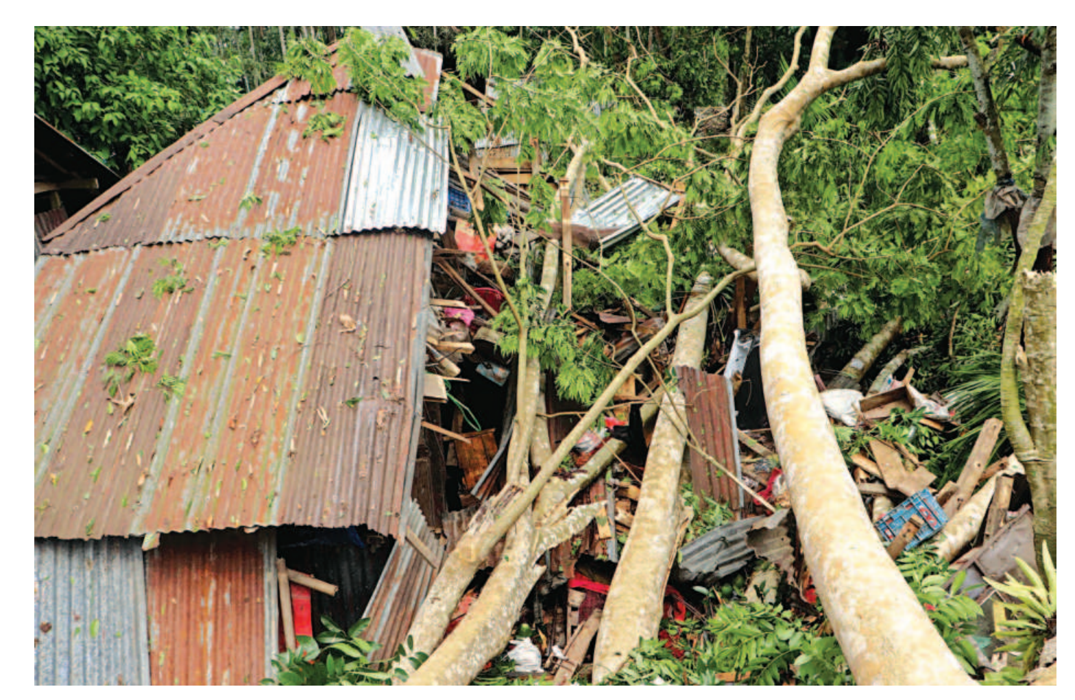
A raging nor'wester battered the Pirojpur district yesterday morning, causing around 100 houses to be damaged by fallen trees. In six districts, the storms claimed the lives of 11 people and injured many more.

In Patuakhali, at least three more people died and a SEE PAGE 6 COL 1