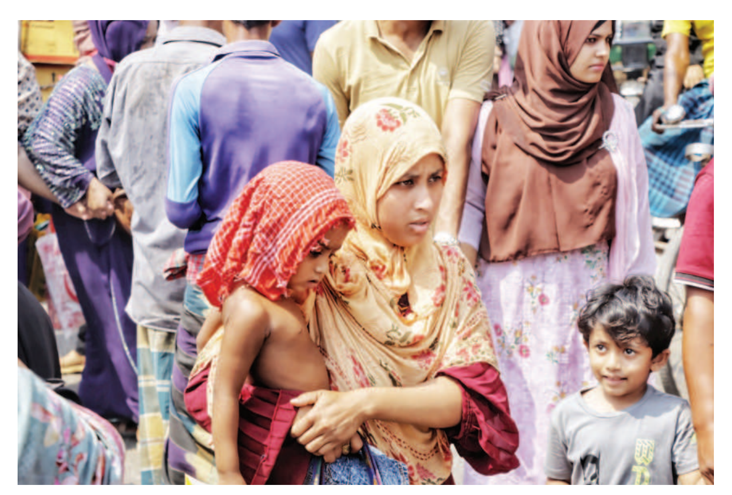
BEATING THE HEAT...A mother removed her son's sweaty shirt and placed a wet towel on his head to keep him cool under the hot summer sun. She is one of many shoppers visiting Khulna city yesterday to do their shopping as Eid drew near. The photo was taken from Dakbangla Mor on Clay Road.