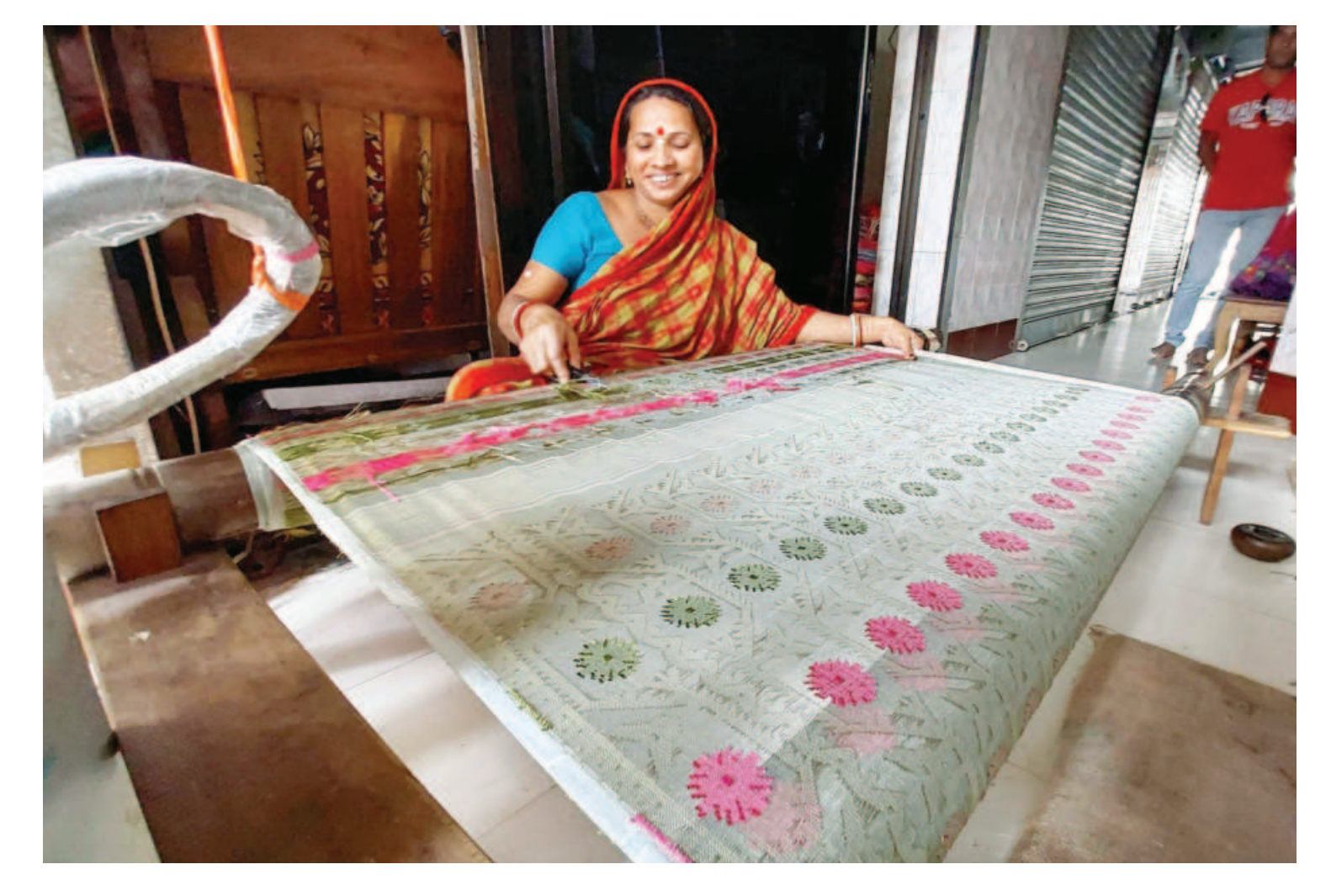
A weaver finishing up a Jamdani sari in Patrail of Tangail's Delduar upazila yesterday. Every year, the district's sari makers try to introduce new designs and patterns, aiming to offer something new to buyers during Eid.

and activists of BNP, he said, "We have been able to control the market. The prices of many products have also come down."