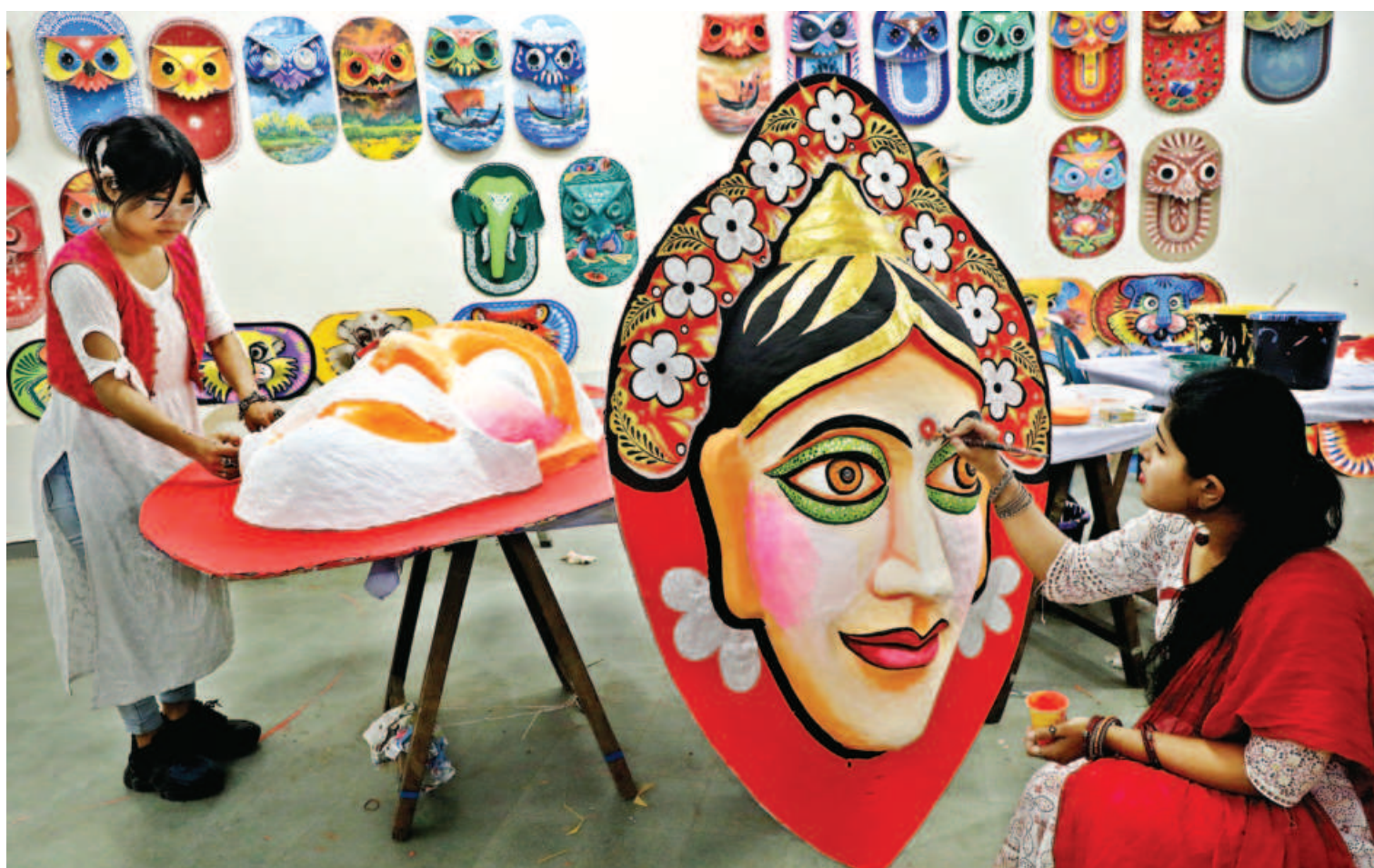
Students of the Faculty of Fine Arts at Dhaka University are busy making masks for the Mangal Shobhajatra, a procession which welcomes Bangla New Year. Pahela Baishakh is celebrated on April 14 with fairs, cultural events and traditional sports.