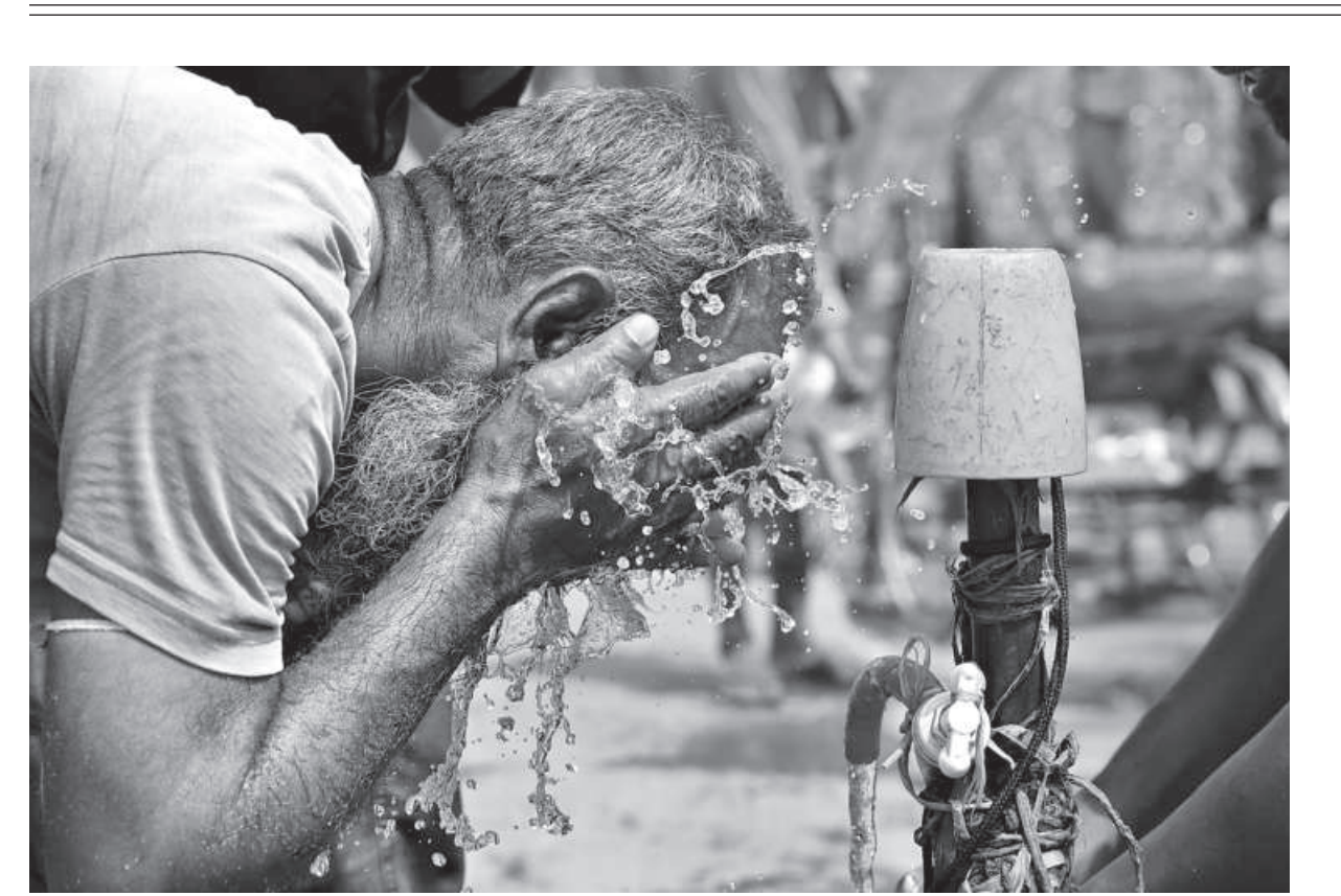
Beaten by the heat, a rickshaw puller takes a moment to cool down at Bangabhaban Staff Quarters' Gate in the capital's Haatkhola yesterday. As the heat sweeps over the country, many are seen suffering on roads, especially fasting transport workers and office goers.