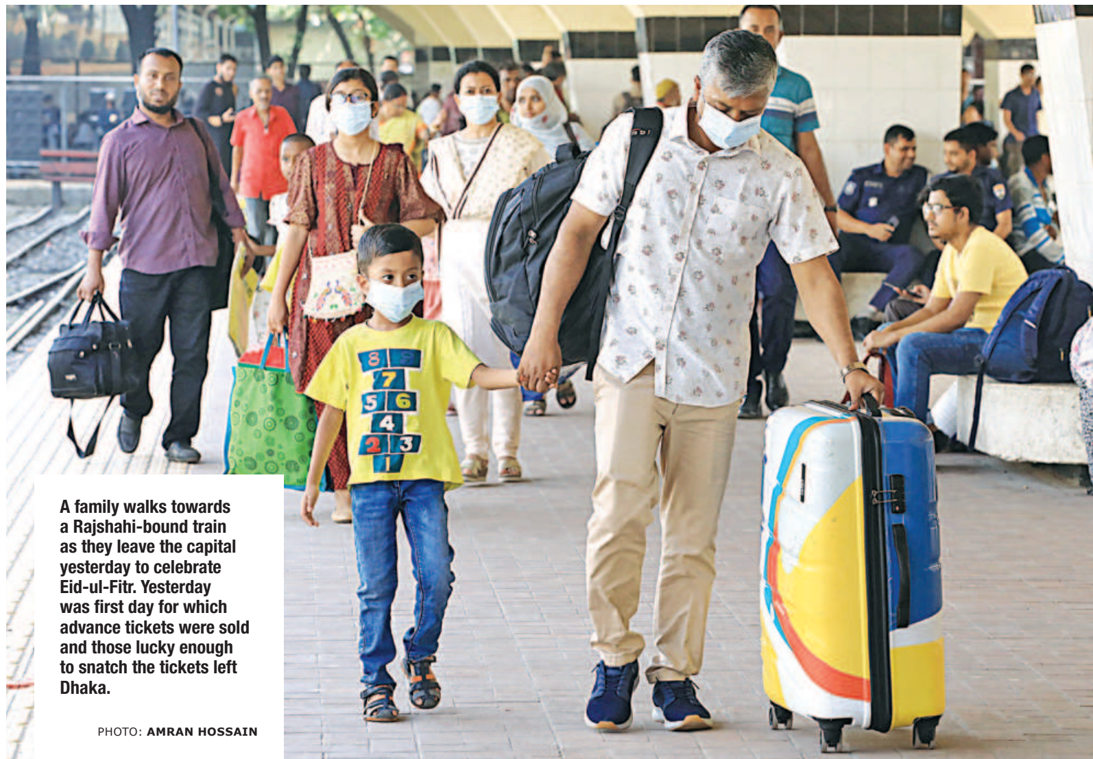
A family walks towards a Rajshahi-bound train as they leave the capital yesterday to celebrate Eid-ul-Fitr. Yesterday was first day for which advance tickets were sold and those lucky enough to snatch the tickets left Dhaka.