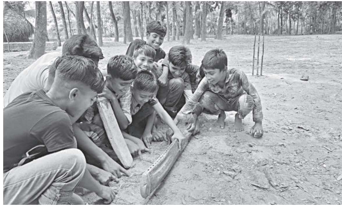
Taking a break from their daily academic activities, a group of friends met up at an open space in Jhalakathi's Bharatkathi village yesterday evening. After stampeding on the uneven ground to transform it into a pitch, they set up the wickets -- three fallen branches from nearby trees. Their faces lit up in joy as one of them drew numbers on the mud and covered it with the bat, putting small lines by its edge as markers and waiting for each player to select one to determine the batting lineup.