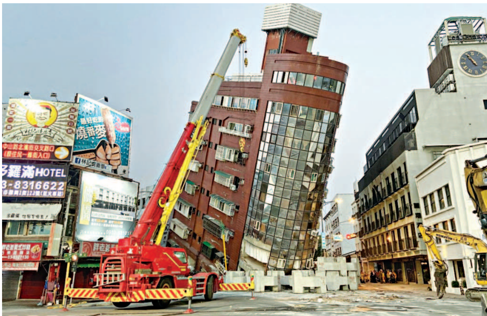
This photo taken by Taiwan's Central News Agency (CNA) yesterday shows a damaged building in Hualien after a major 7.4-magnitude earthquake hit Taiwan's east.