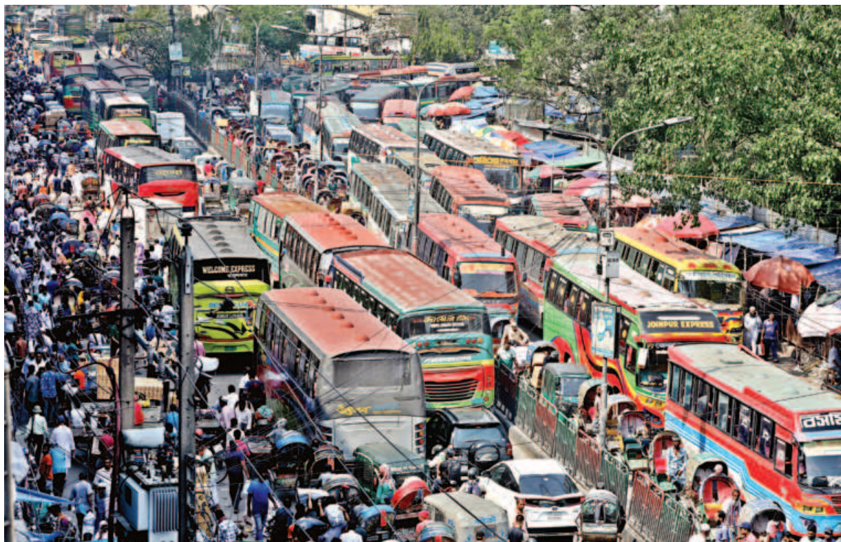
Both roads through Bangabandhu Square in Gulistan were entirely gridlocked for hours yesterday afternoon, mostly due to a huge number of buses, many of which were headed outside the capital. Footpaths lined with hawkers, rickshaws being driven haphazardly and scores of jaywalkers only worsened the situation.