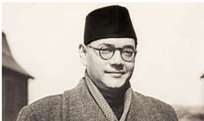
Subhas Chandra Bose (1897—1945)