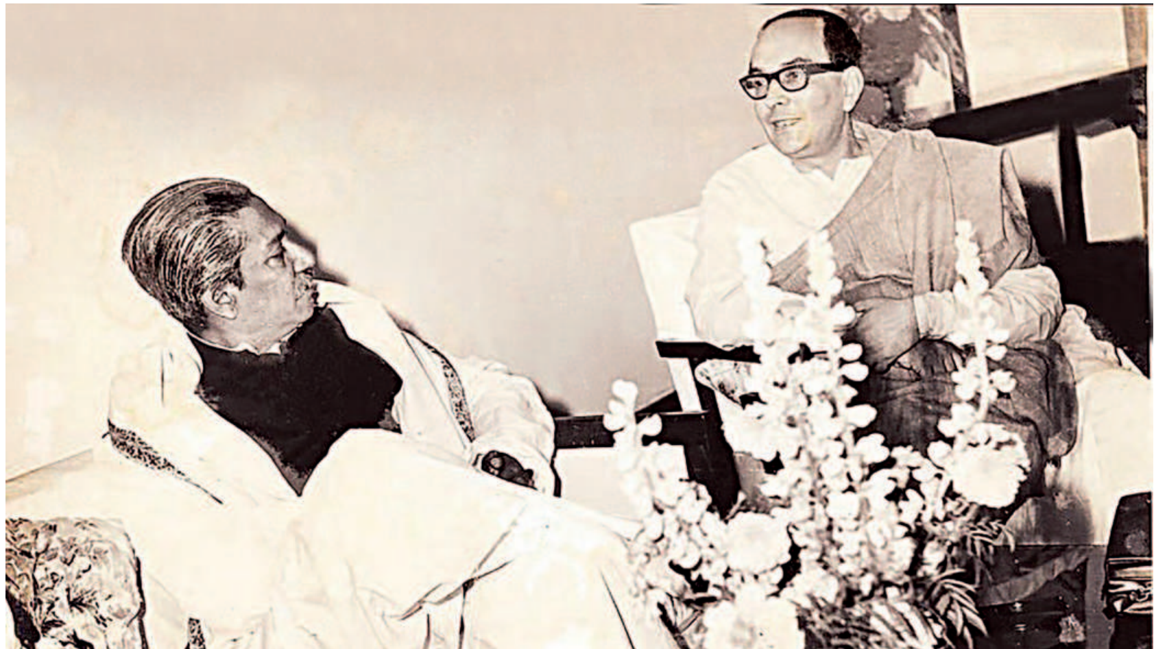
Bangabandhu Sheikh Mujibur Rahman and Sisir Kumar Bose in Dhaka, January 1972.

As previously mentioned regarding the Indian Ocean and Bay of Bengal, it's crucial to focus on the eastern regions of India and Bangladesh to explore the potential for extending our communication networks with eastern Asia and Southeast Asia. This strategic approach could significantly enhance our economic prospects. Notably, significant progress has been