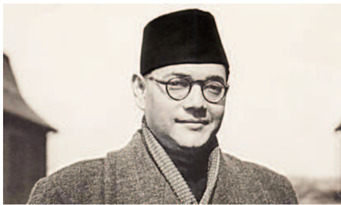
Subhas Chandra Bose (1897—1945)