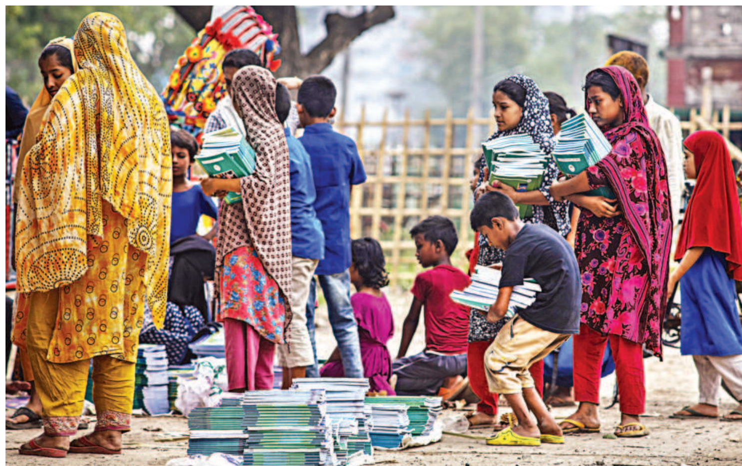
Nearly three months have passed in the current academic year, but many schoolchildren are yet to have their free textbooks. Some students are seen carrying books to their schools in Dhaka's Rayer Bazar area yesterday. An official said distribution of free textbooks among underprivileged children under the non-formal education programme was delayed due to late printing.