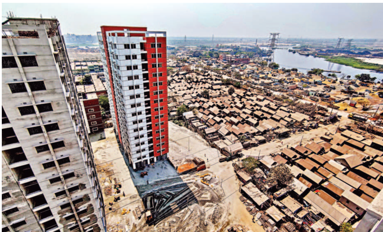
The Ecne-approved government housing project for cleaners in the capital's Gabtoli still remains incomplete. The DNCC mayor in 2019 had announced that it would be completed by 2021. However, it was delayed due to a lack of funds while an extension remains yet to be approved by the Cabinet Committee on Government Purchase. With 90 percent of the work already done, it is now expected to be completed in 2025. Four 15-storey residential buildings and a four-storey school building were promised for 784 cleaners, who currently live in small shanties that can be seen just a few feet away from the Tk 284 crore housing project.